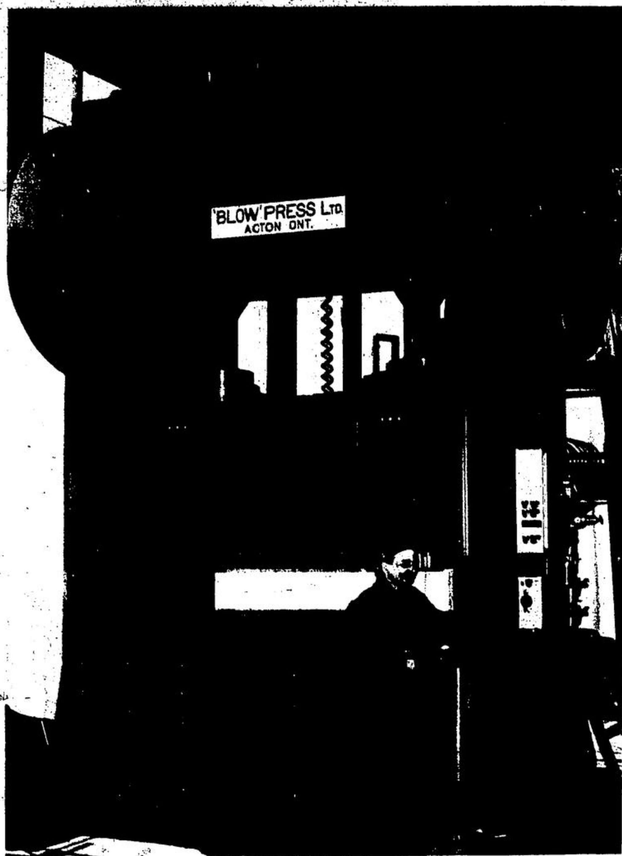
ONE OF THE HUGE PRESSES shipped from plant produces one press a week for many Blow Press where they are manufactured in different types of industry. given a final test by Eddie Wilson. The Acton