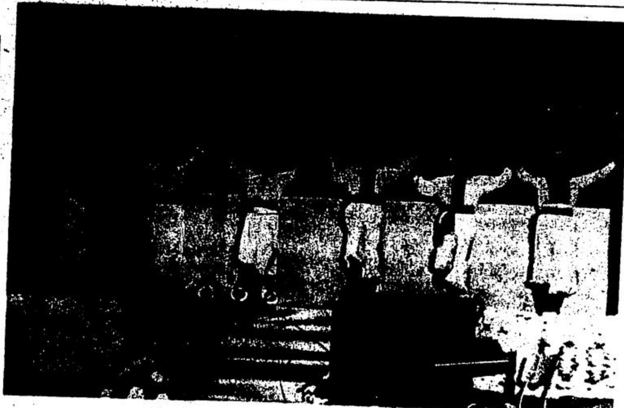
Clapping, cheers accompanied Ukrainian group