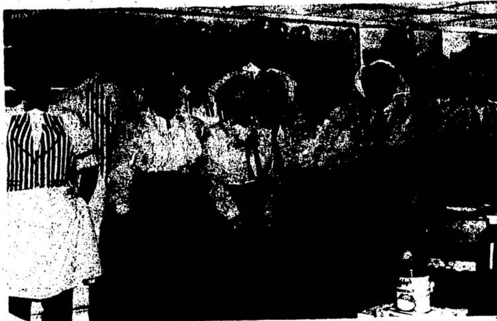
I.G.A.'s STAFF play the old fashioned theme to the hilt for the special promotions this week and last. Congenial Harold-Manes had the staff assemble for a quick shot with a touch of flash powder.