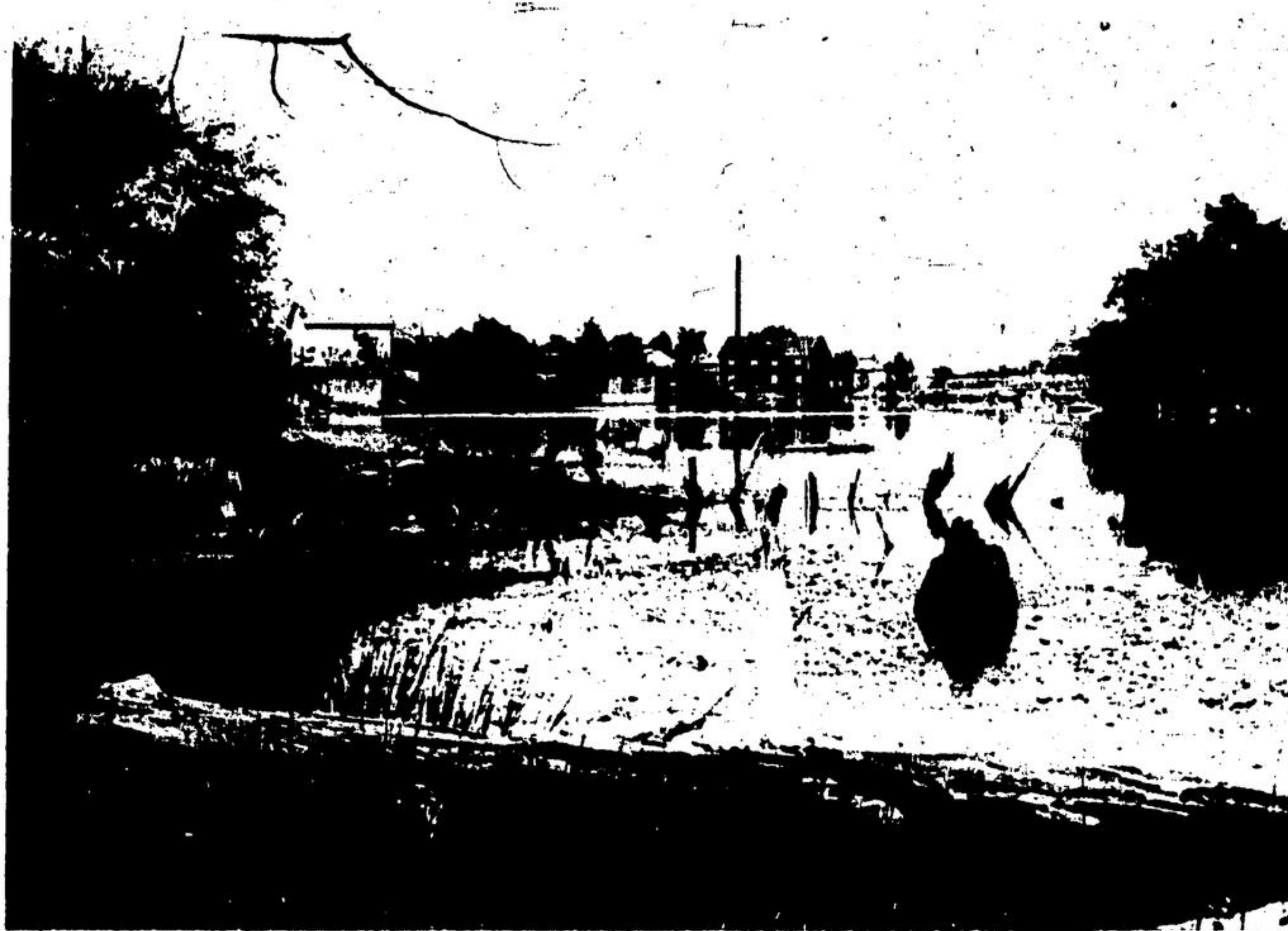
DREDGING NEEDED! Fairy Lake, looking east, in 1899. (The glass negative has been damaged). Notice Acton Flour Mills, prime reason for the lake's existence and you can also make out the Beardmore and Co. smoke stack in the distance.

LOVELL BROS. 1867 1967 MODERN MEAT MARKET 77 Mill St. Acton 853-2240