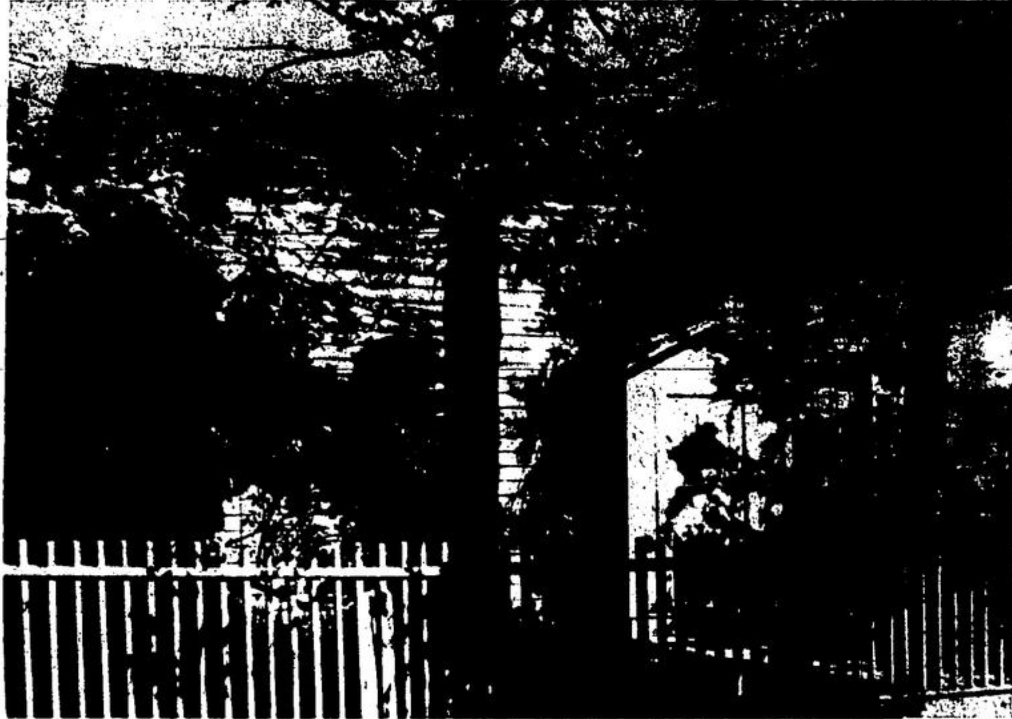
MRS. SMITH'S RESIDENCE, built in 1834, was there? photographed in September, 1899. Is it still

January - A ballot was taken on the by-law for the purchase of a new cemetery on Monday last which resulted in its defeat by a majority of 8. Very little interest had been taken except by the Village Council and the proprietors of the movement until the past week when several parties who were prejudiced on the subject began to put afloat wrong impressions in reference to the site chosen and the time which would expire before possession of the property could be obtained. On the day of the election considerable excitement was manifested and those not in favor of the by-law worked all day against it and eventually succeeded in its overthrow.