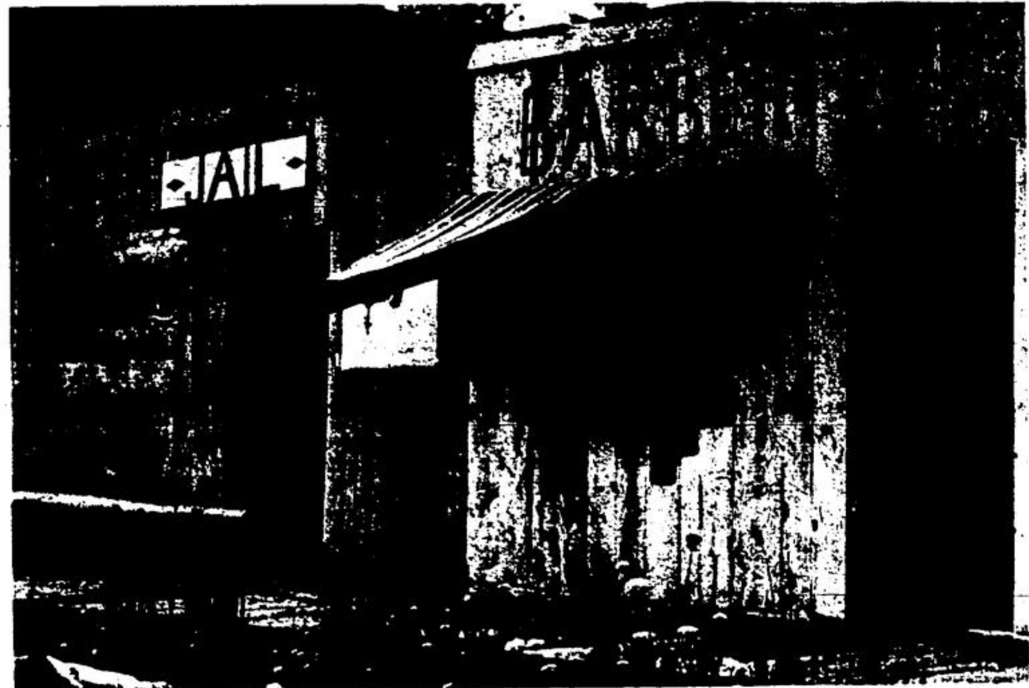
WHAT'S A WESTERN town without a jail or a barber shop? Boarded up windows help to create the phantom effect of a ghost town.

a new electric range lets you cook a full course meal when you're miles from home