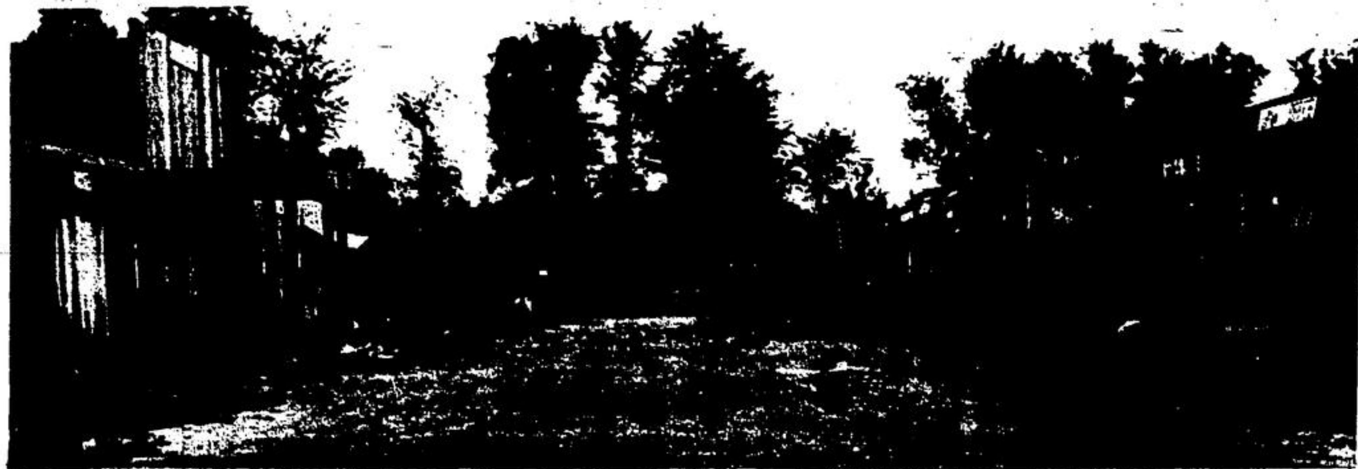
GHOST TOWN? Only a few miles from Acton stands a deserted western village much like one you'd see in the American west. Turn to the second front for further scenes. (Staff Photo)