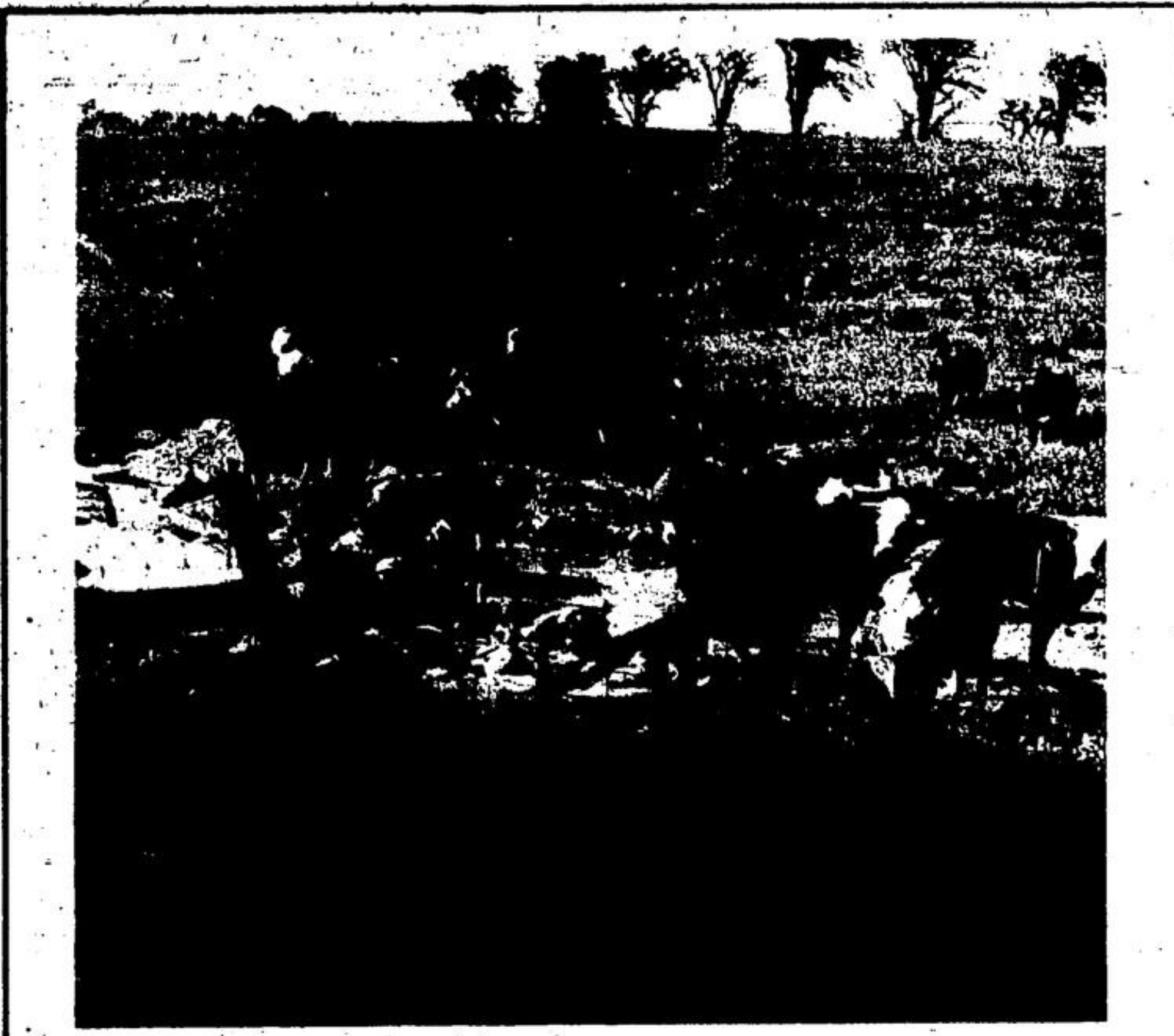
THERE'S NO SHORTAGE of water for cattle in this year of abundant rain. Grass is lush and sleek and cattle are almost hidden by its height.