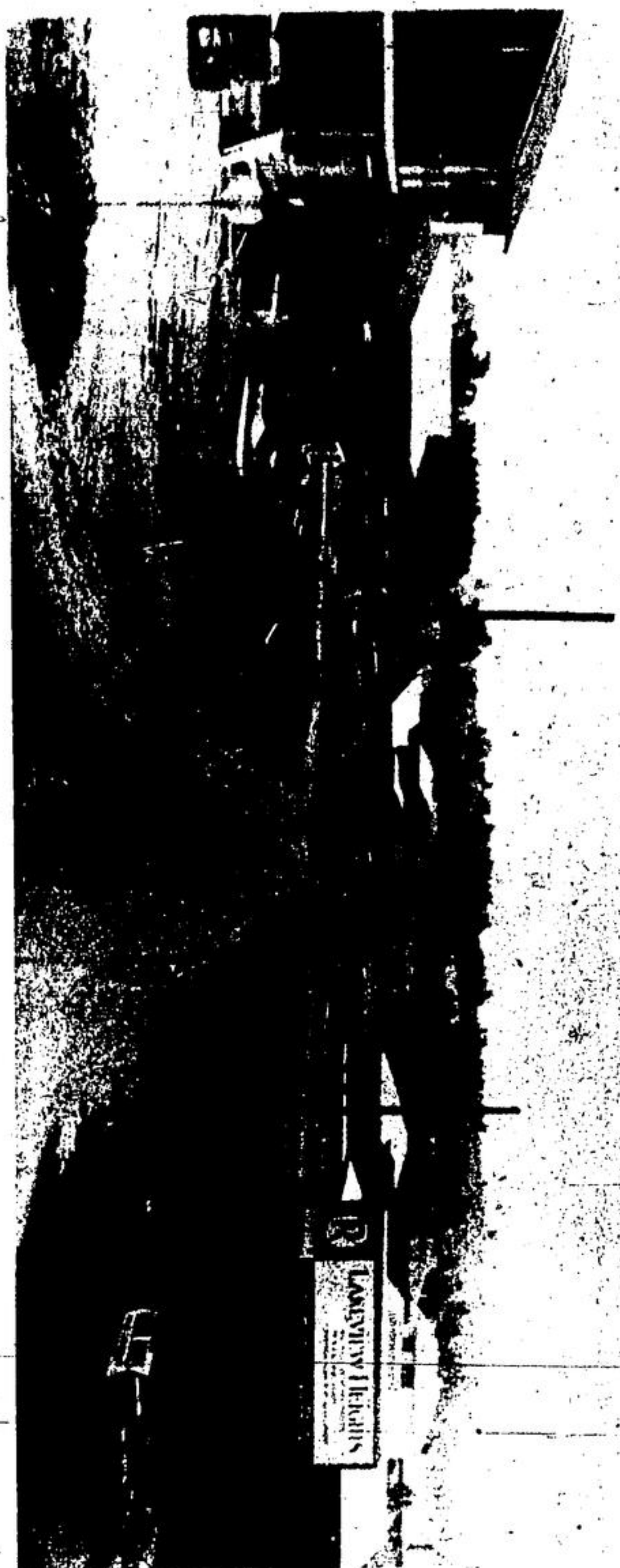
A residential building boom started this spring in Lakeshore subdivision. Initial erection is 50 homes.