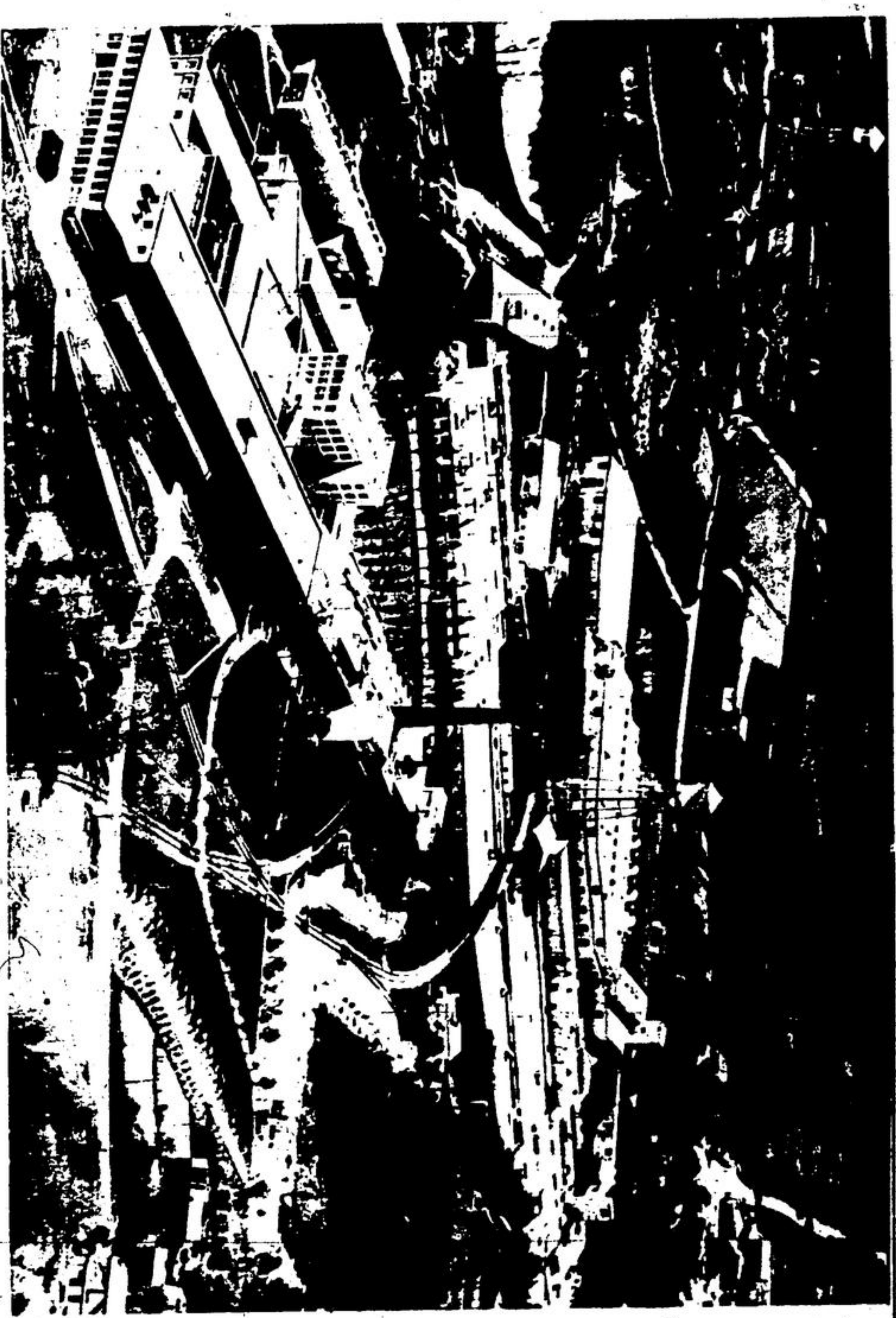
BEARDMORE AND CO. PLANT AND OFFICE Tanners since 1844