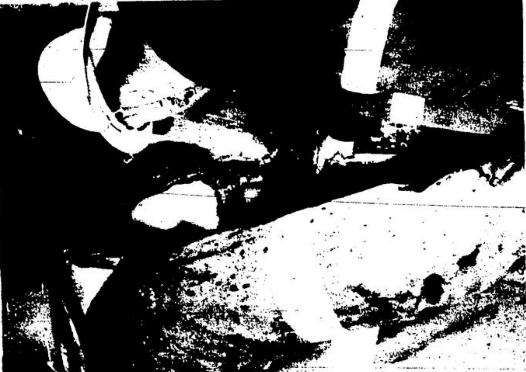
FIREFIGHTERS INSPECT DAMAGE AT FIRE

Trucks are quickly dispatched to the fire destination and a close contact is kept between