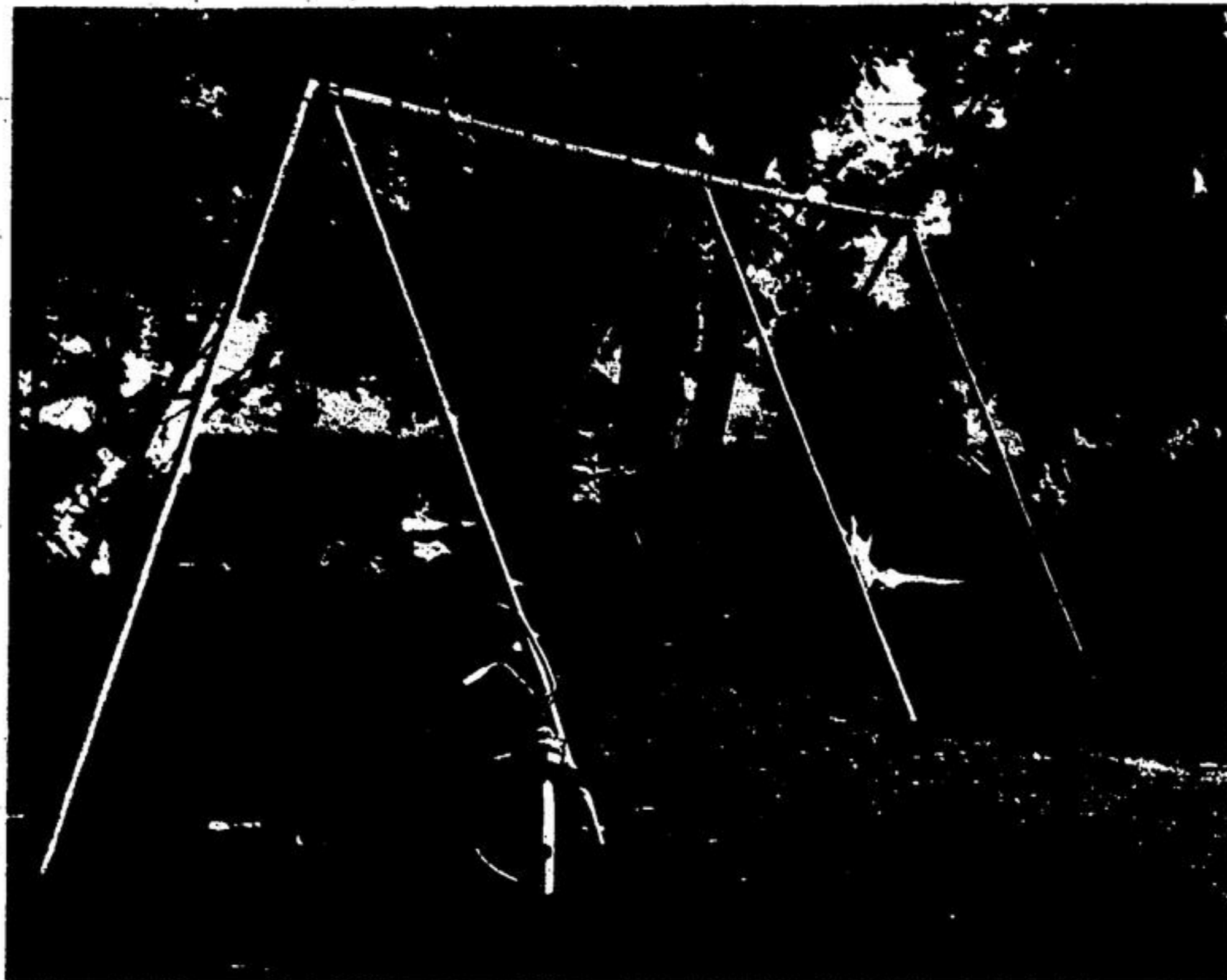
CAMPBELLVILLE BALL PARK has been brightened up with the addition of monkey bars (not shown), six swings, a slide and three teeter totters, as part of Nassagaweya's 1967 centennial project. Children from the village are shown having fun on the new equipment.

Admission to Friday's program is $1 per person and Saturday's admission is $2 per car.