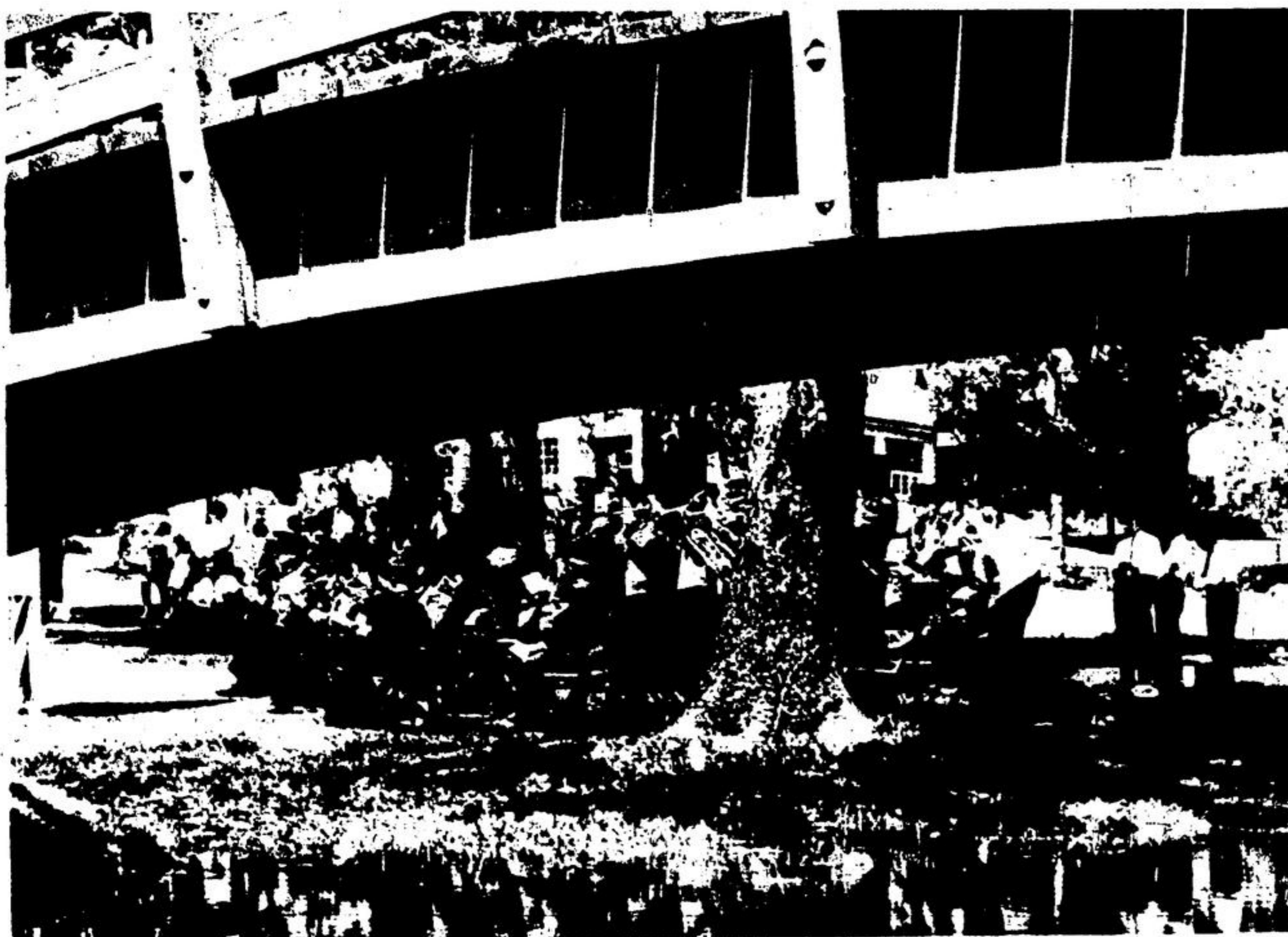
CROWD OF about 250 clustered in the shade for the introductions and speeches at Saturday afternoon's ceremony, on the first warm weekend. (Staff Photo)