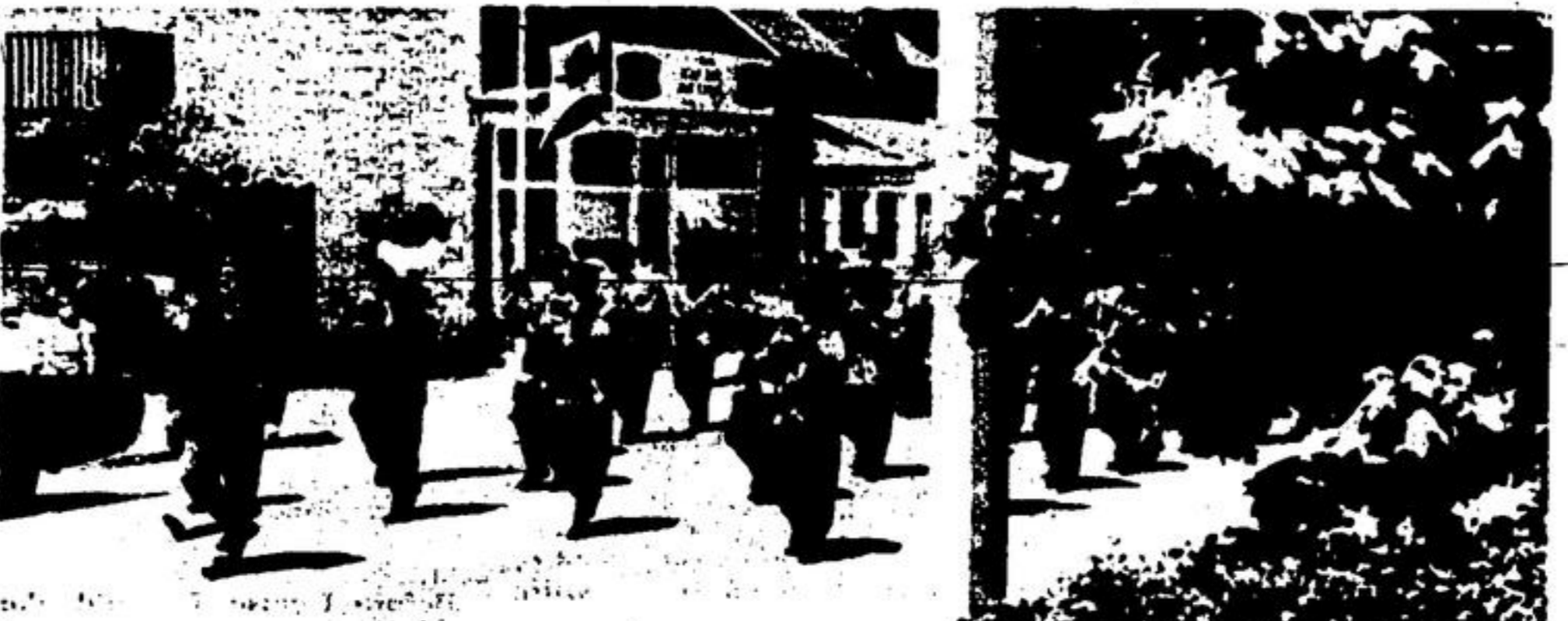
SMART-LOOKING UNITS in Sunday's Decoration Day parade were Acton Firefighters, top, Acton Branch of the Canadian Legion and Cub, Scout, Brownie and Guides. Acton Citizens' Band led the parade.