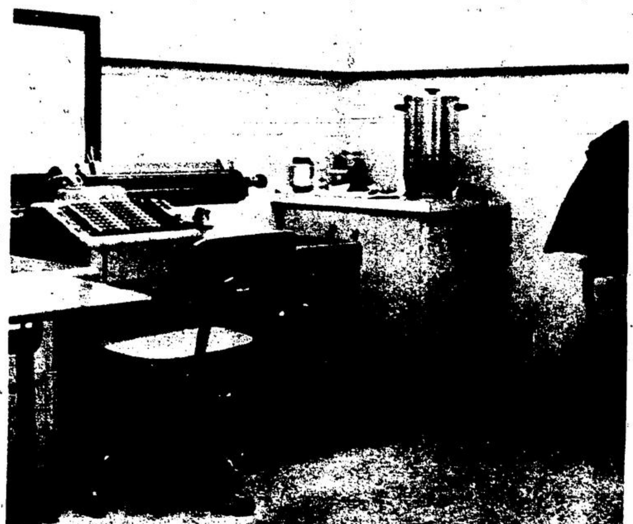
MACHINE ROOM in the new hydro building is soundproof which restricts noise seeping through to the general office.