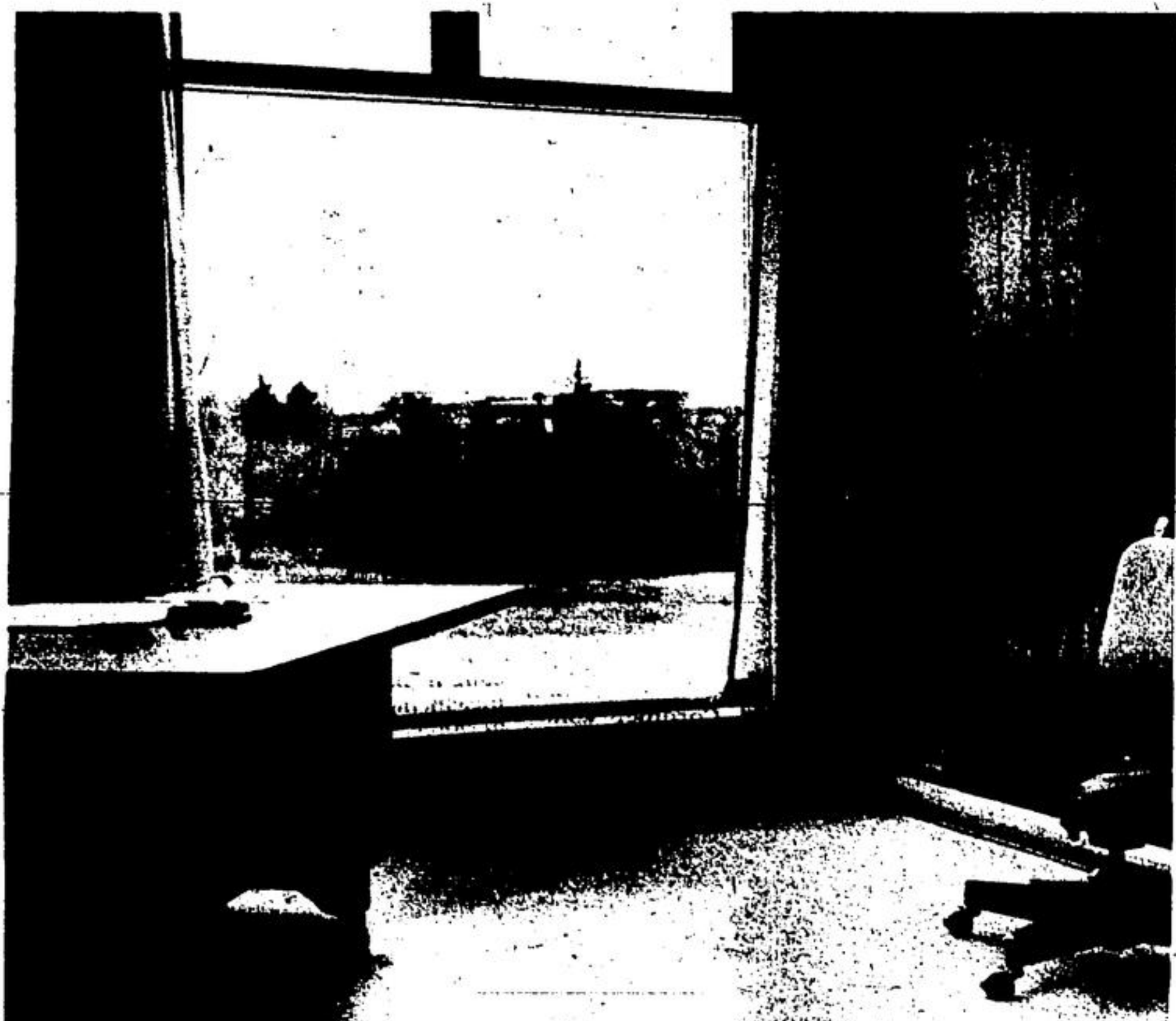
MANAGER'S OFFICE , like the rest of the new building, presents a quiet haven for conferences away from the clutter of machines in the main office.