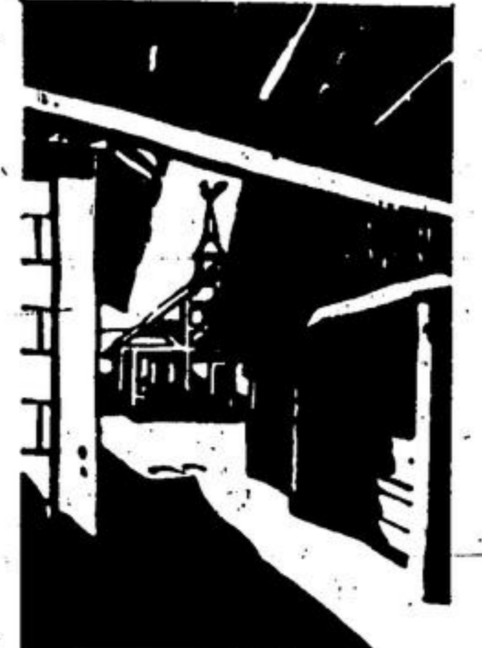
Sainte-Marie among the Hurons, at Midland