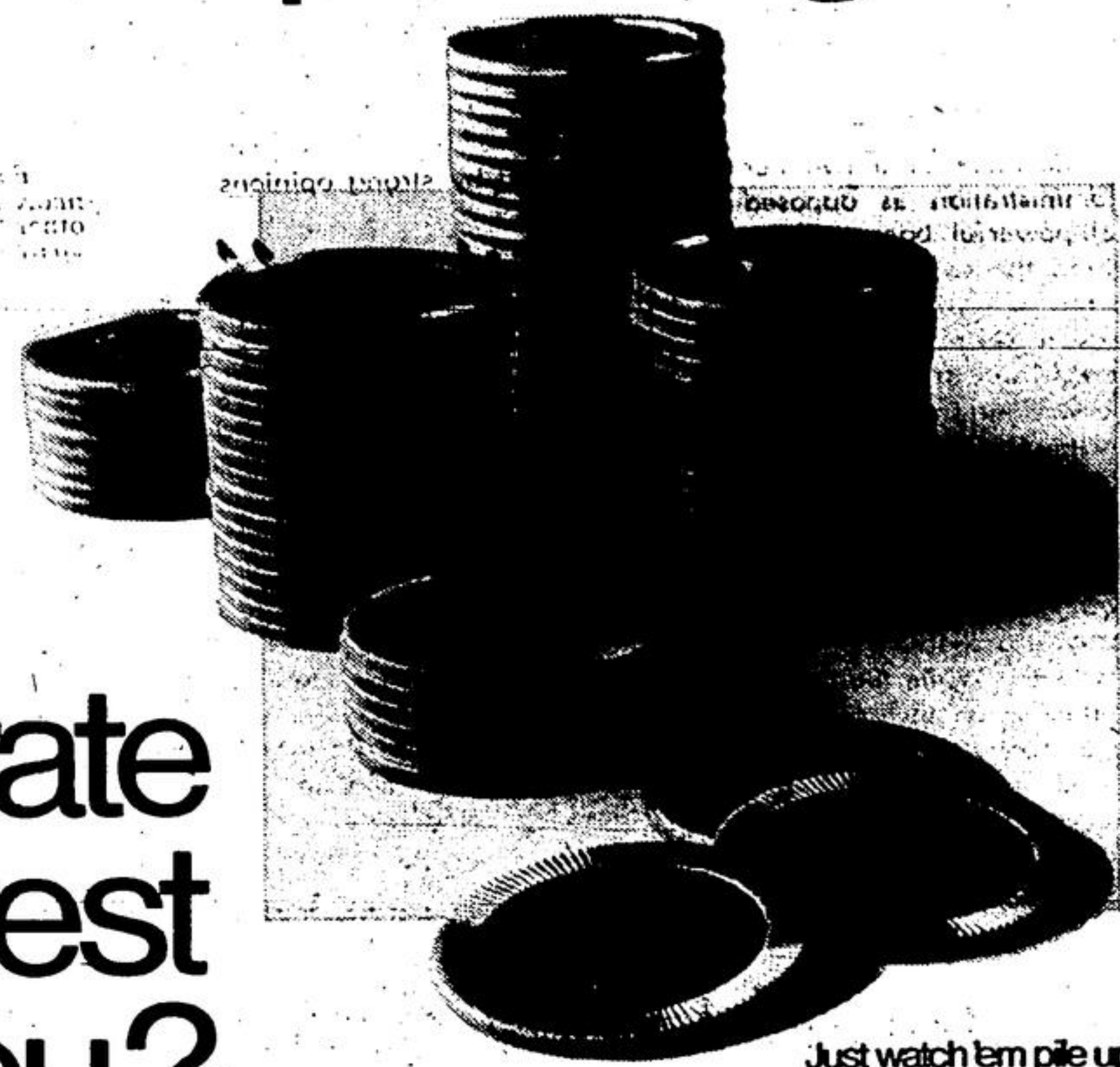
Just watch 'em pile up.

Doesn't that rate some interest from you?