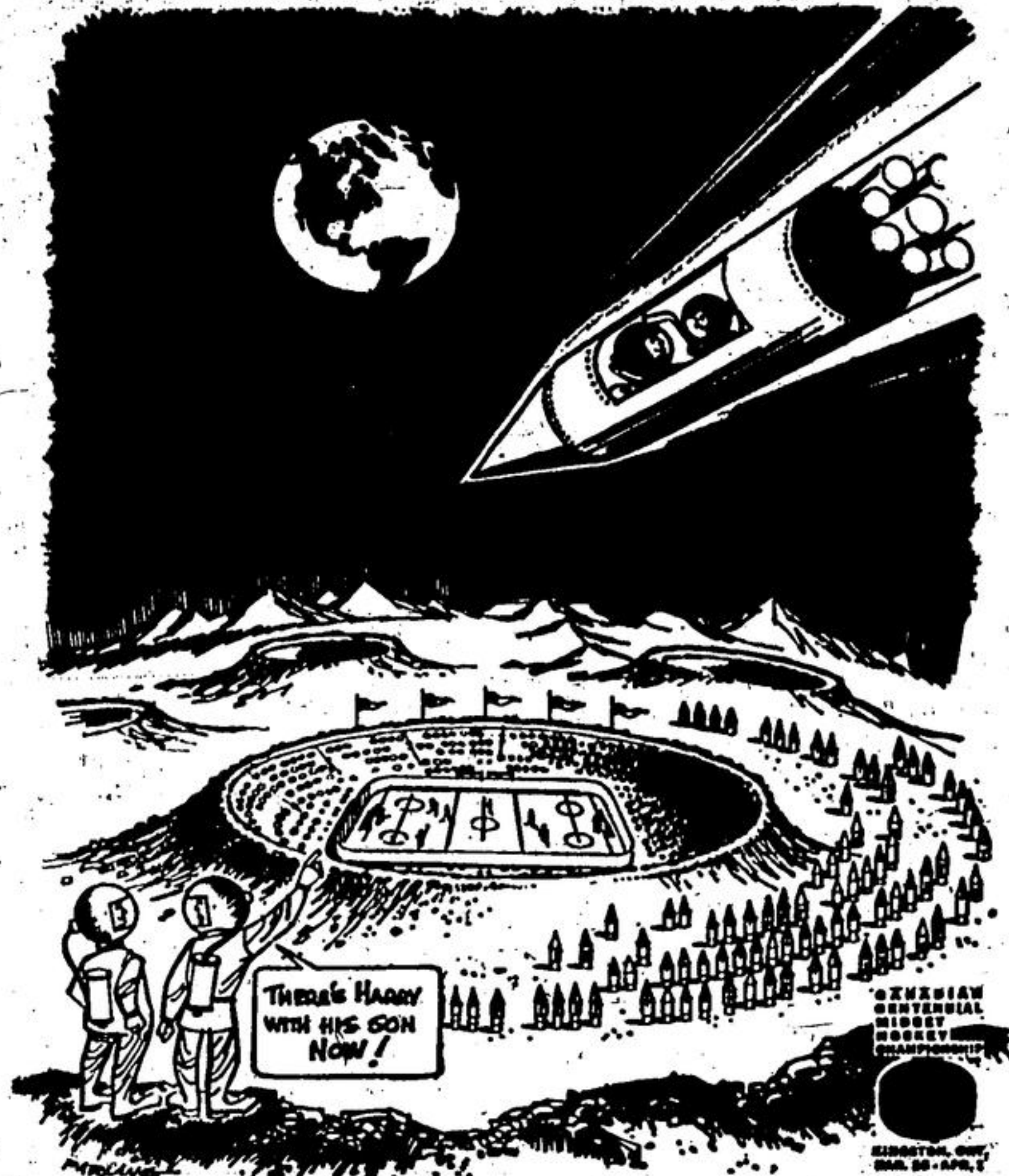
MINOR HOCKEY WEEK STARTS SATURDAY, JANUARY 21