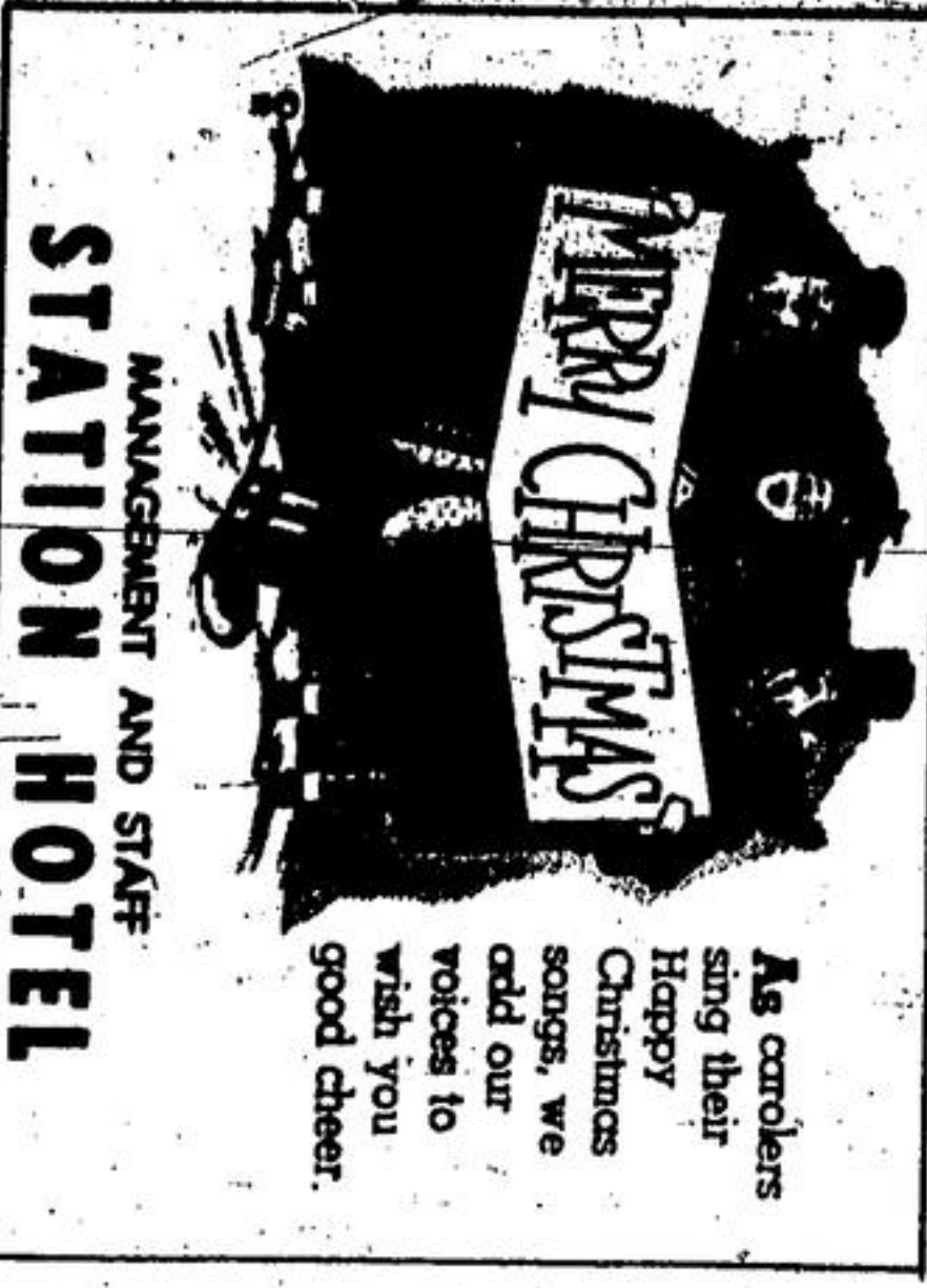
MANAGEMENT AND STAFF STATION HOTEL

There is no more popular Christmas toy than the doll. It is a big business. But perhaps it is not as important to the boys and girls as it is to the adults. Some of the more popular dolls are: