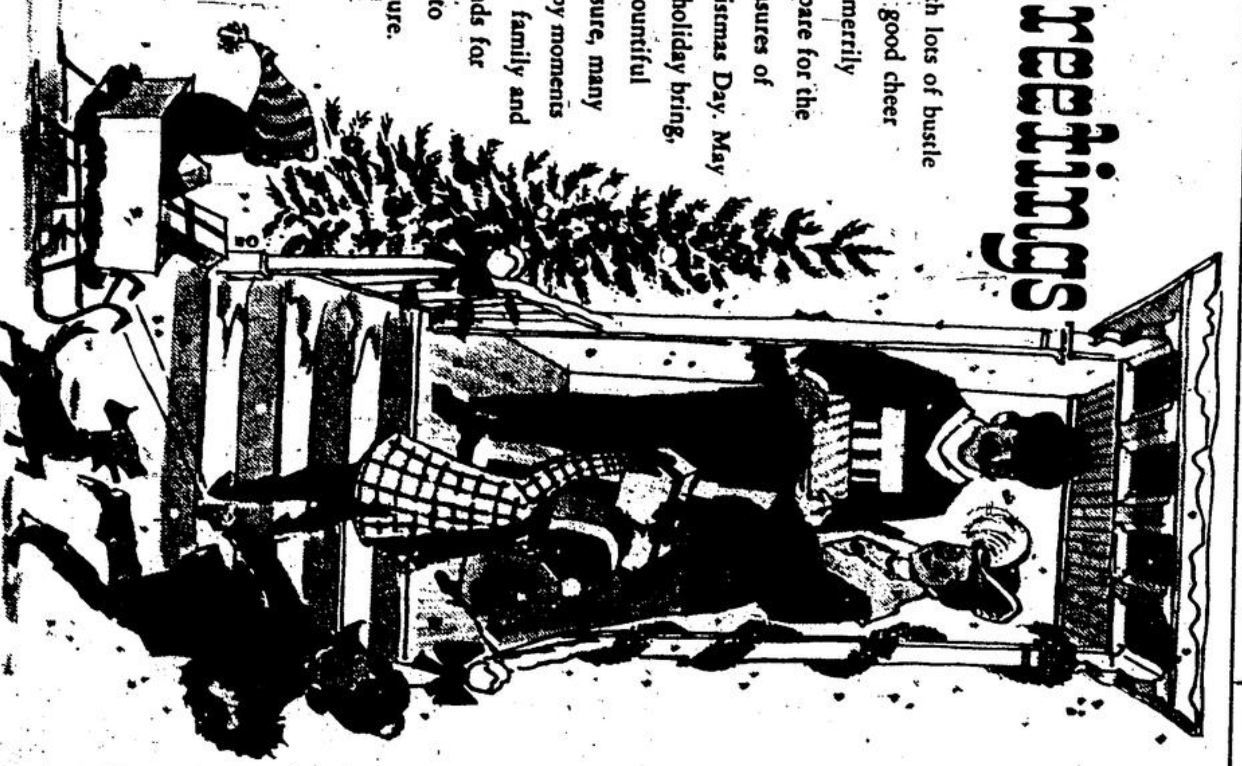
MANAGEMENT AND STAFF HINTON'S 5c to $1.00 STORE

With lots of bustle and good cheer we merrily prepare for the pleasures of Christmas Day. May the holiday bring, in bountiful measure, many happy moments with family and friends for you to treasure.