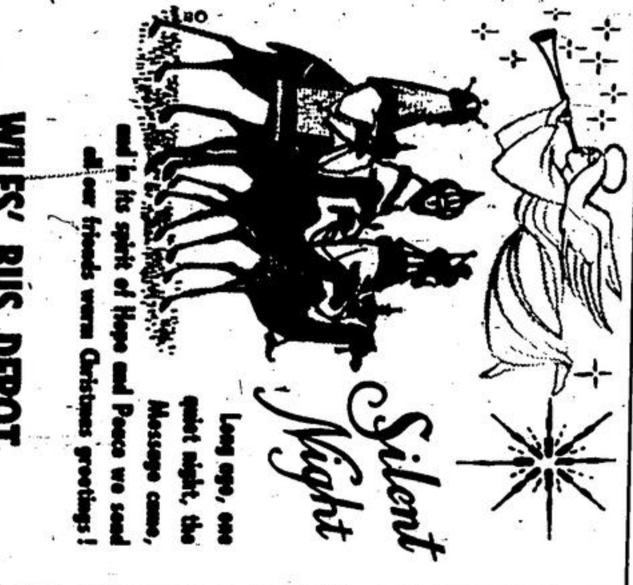
WILES' BUS DEPOT

Control by applying direct pressure with a clean dressing directly on the wound, or by tightly grasping the entire wound area. Small wounds: always require cleansing with water around the wound. A sterile (germ free) dressing should be placed over the wound to prevent the entry of more germs. Asphyxia — this partial or complete stopping of breathing is caused by electric shock, drowning, poisonous gases etc. Remove the patient from the cause of the condition and commence artificial respiration at once. Make sure the mouth and throat are free of obstruction and keep the patient warm. Shock can be fatal and may occur with any accident or sudden fall.