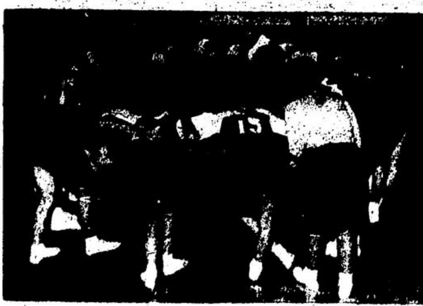
NO SEWING CIRCLE! Just the Acton District High School girls' volleyball team in a huddle giving the school yell prior to the start of the tournament against other schools last week. Acton won the tournament and played in Guelph Saturday at the CWOSSA finals.