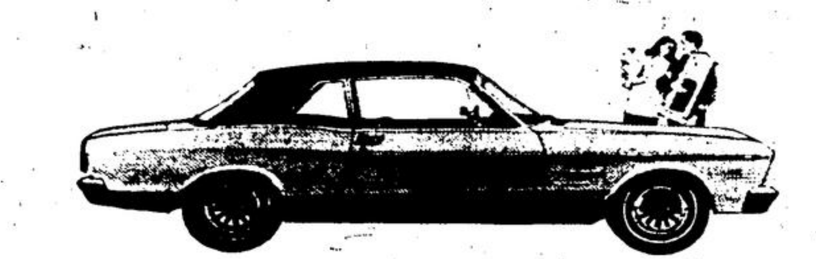
Falcon Futura Sports Coupe

More and more people are buying Ford Hardtops! Here's why: Ford hardtops have a special appeal that's all their own. Their secret is the unequalled Ford styling — plus all the new ideas in features for motoring enjoyment. The Ford LTD Hardtop with its new formal roofline and leather-smooth vinyl covering introduces you to a whole new world of style — with luxury to match. The Fairlane 500 XL is the latest expression of big car roominess in the elegance of the unquestioned midweight champion. Mustang — the very sound of it is a call to adventure. And once you've seen Mustang's new hardtop styling, you'll answer its call! Falcon is the limousine of the compacts. The one car you can buy for its luxury and count on getting economy as a bonus. See the full range of Ford hardtops at your Ford Dealers. You'll fall in love with their good looks and much more besides.