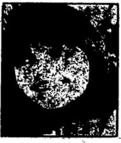
ANNE WRIGHT "After 4" TV Model Judy Welch Trained