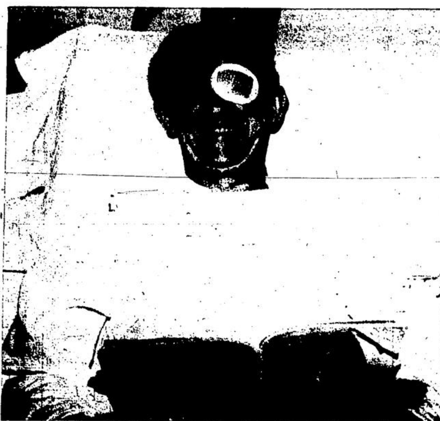
A PATIENT with one eye already restored to seeing through the Eye Bank service enjoys the pleasures of reading while his second eye is recovering. The Eye Bank is one of the prevention services of The Canadian National Institute for the Blind.

The purpose of these Donor Clinics is to provide the citizens of Acton and district with the opportunity of signing a donor card that will upon death, make the eyes available to the Eye Bank of Canada, for corneal transplants and lab work.