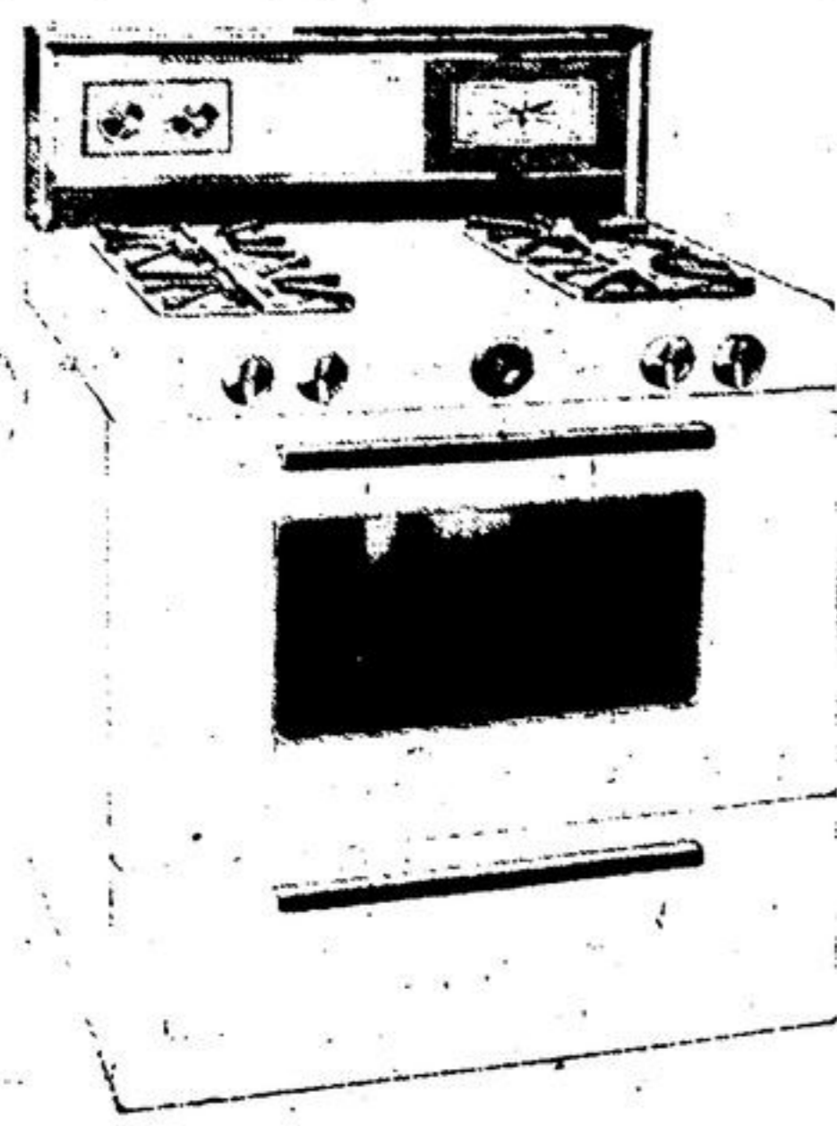
MOFFAT, FINDLAY, TAPPAN - GURNEY, ENTERPRISE, BEACH.

In addition, you have a chance to get a modern gas dryer for as low as $199.95, no down payment, or as little as $4.35 a month on your regular gas bill. Each quality gas dryer is gentle enough for any fabric, and a must for permanent press garments. Only a gas dryer gives you complete circulation of warm air, at a speed that leaves clothes fresh and wrinkle-free and what a big difference in operating cost. Take advantage of the special low prices on these gas dryers now.