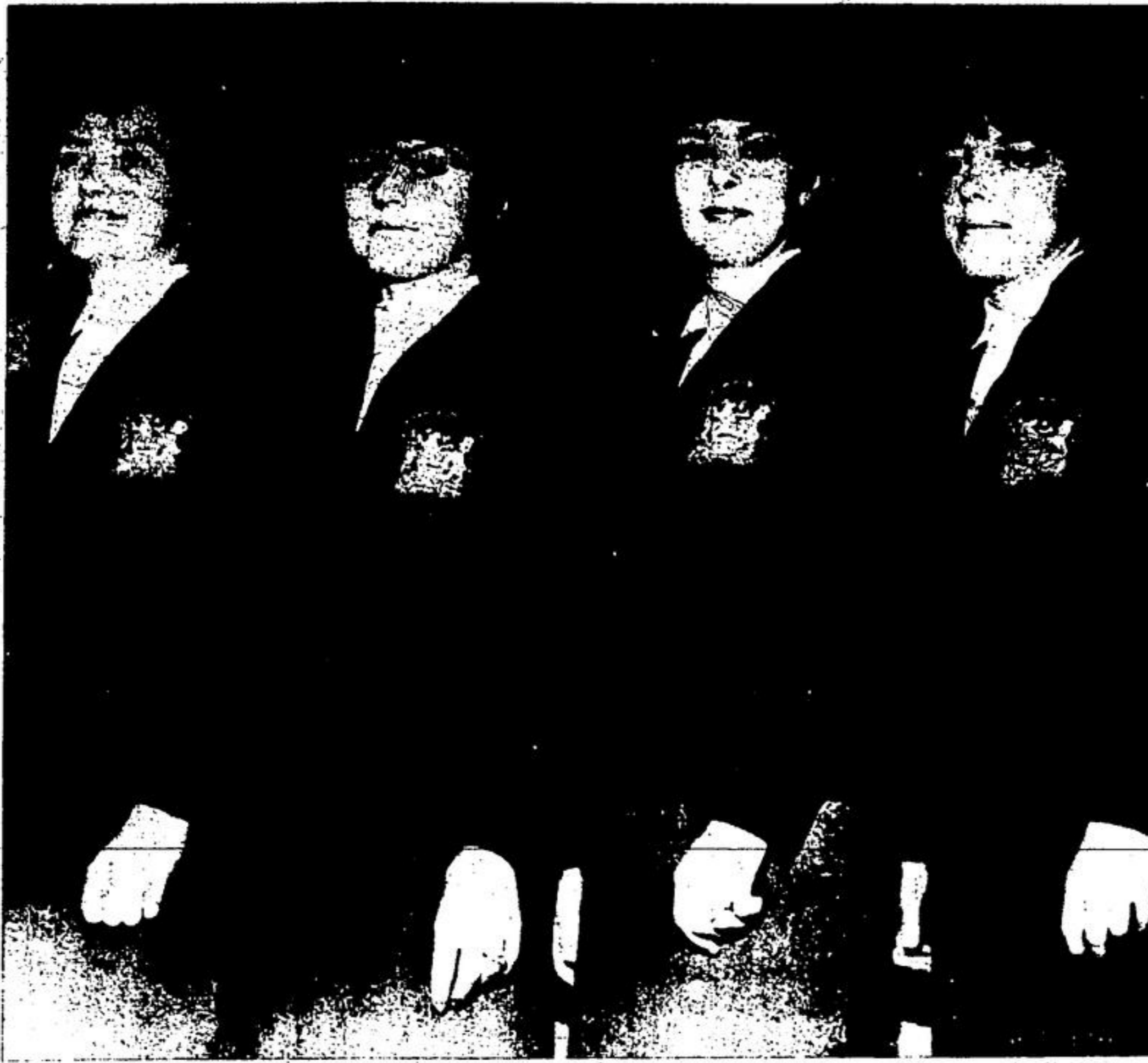
BANK OF NOVA SCOTIA staff members now wear trim uniforms comprising burgundy blazers with the bank crest, white blouses and grey skirts. Acton's branch is one of few to have adopted the attractive new uniform for the

If you are travelling this summer, keep speed down and "Bring 'em back alive!"