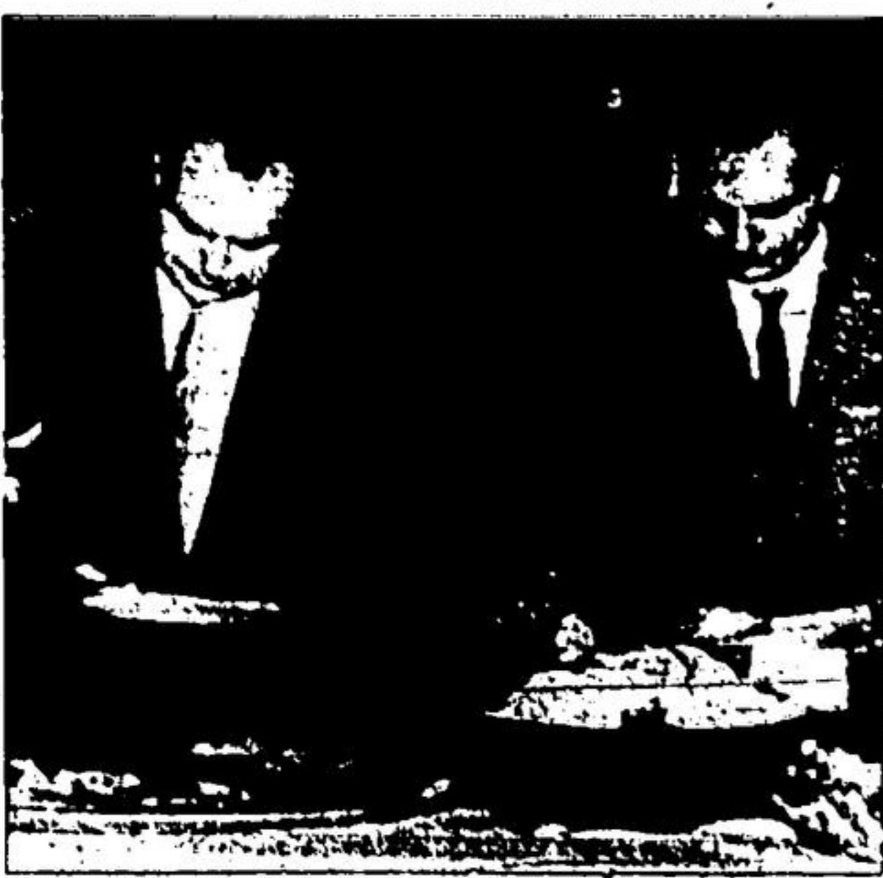
BUFFET LUNCHEON was a highlight of the Beardsmore tour Monday for over 80 members of the Industrial Accident Prevention Association. Two of the group heap plates with tasty servings. Parkview Motel catered.