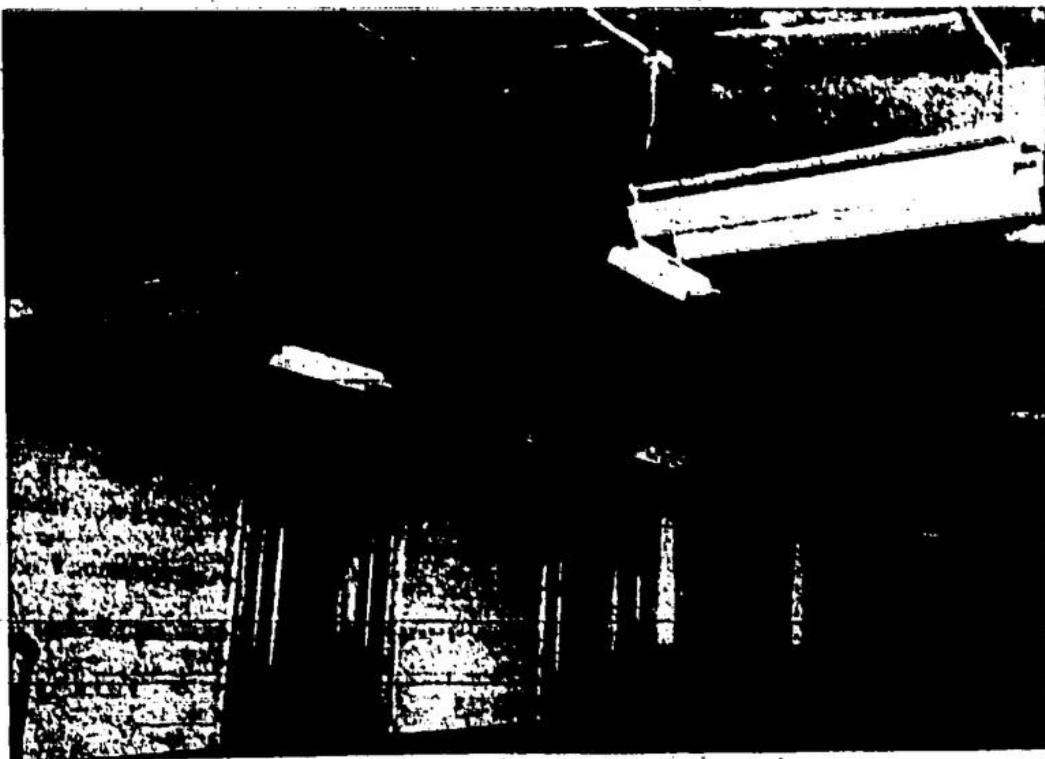
Interior view of Warehouse area showing overhead infra red heaters and new lighting system.

We are proud to have been chosen as Contractors and Suppliers for ELECTRICAL WORK and HEATING UNITS