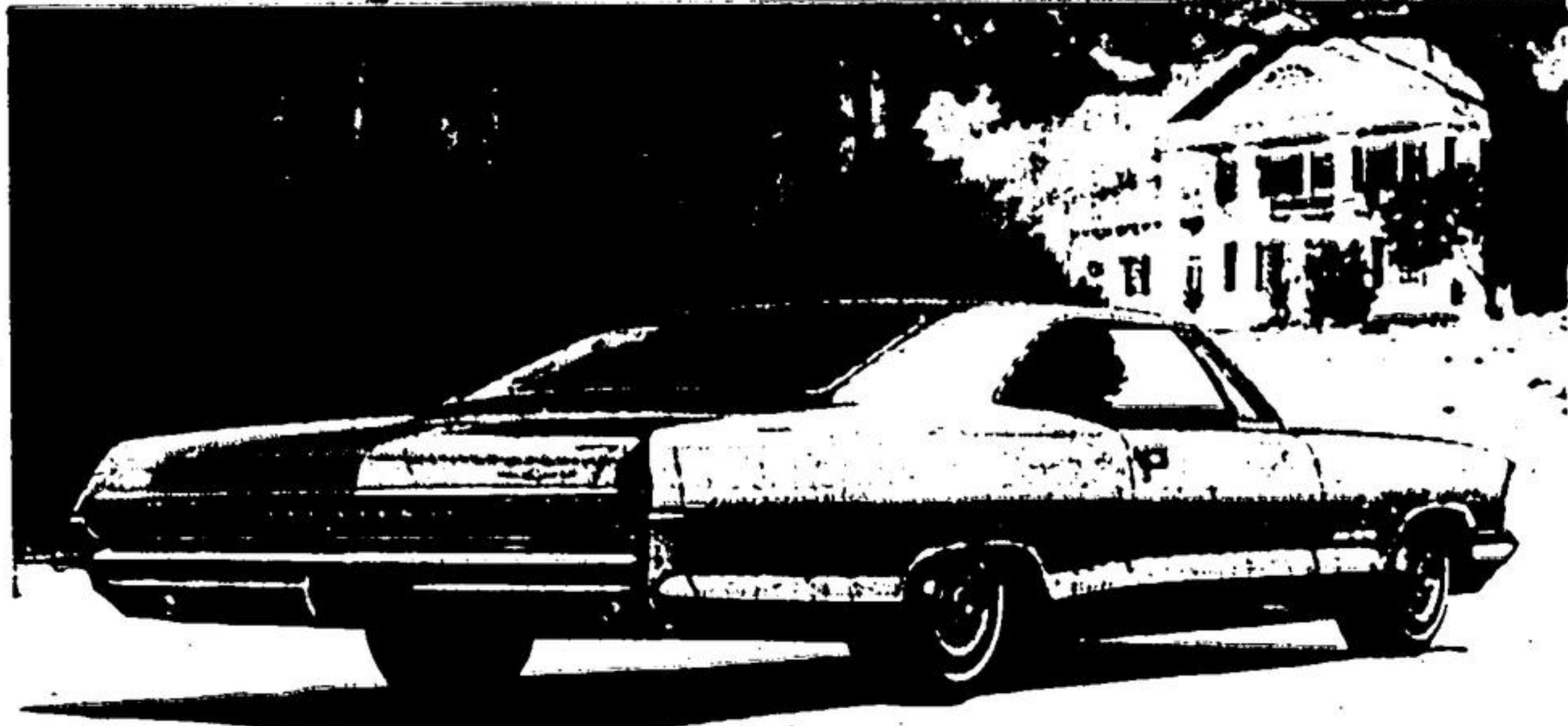
Parlane Custom Sport Coupe