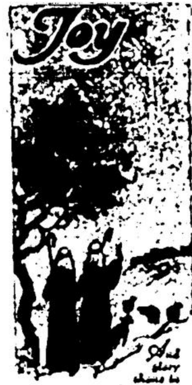
Let your joy be the reason for a great joy to yours.

Jail prisoners will be served with roast young turkey with all the usual trimmings and cranberry sauce. Dessert features pud-