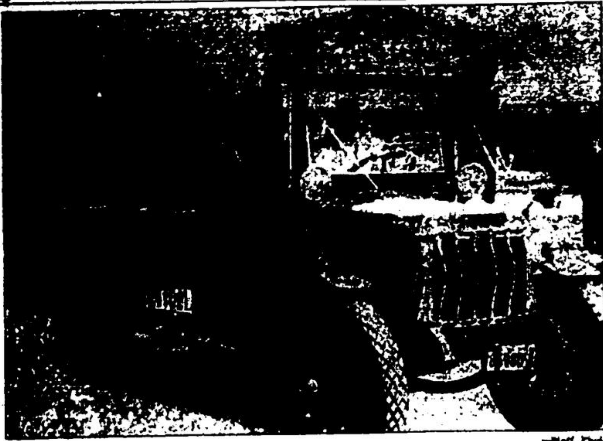
ACTON BANDSMEN never had it so easy. Instead of marching from the town hall to the C.N.R. station Saturday, bandmen saved their energy and enjoyed a ride on the Charabanc sponsored by Tyler Transport Ltd. The vehicle was used during the afternoon to take fair visitors for rides around the race track.