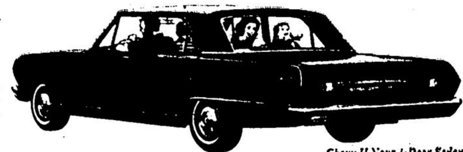
Chevy II Nova 1-Door Sedan

It may very well be the expensive-est looking thrift car you've ever laid eyes on. But thrifty it is. The big difference this year being that Chevy II's marvelous mechanical efficiency now comes decked out in a debonair new look.