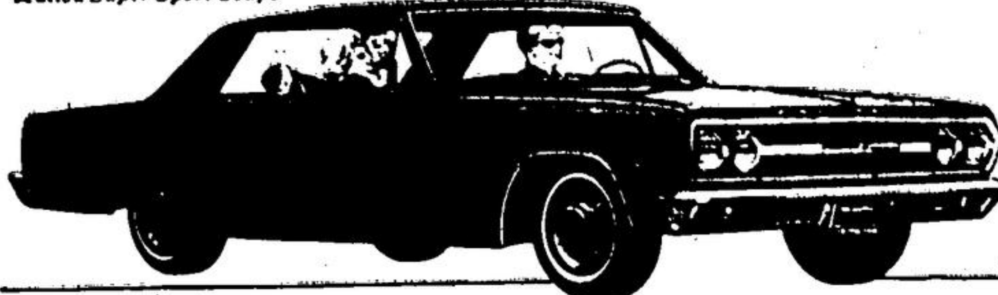
Malibu Super Sport Coupe

In fact, just about everything's new right down to the road. And even that'll seem newer because the Jet-smooth ride is smoother than ever, with a new Full Coil suspension and new Wide-Stance design.