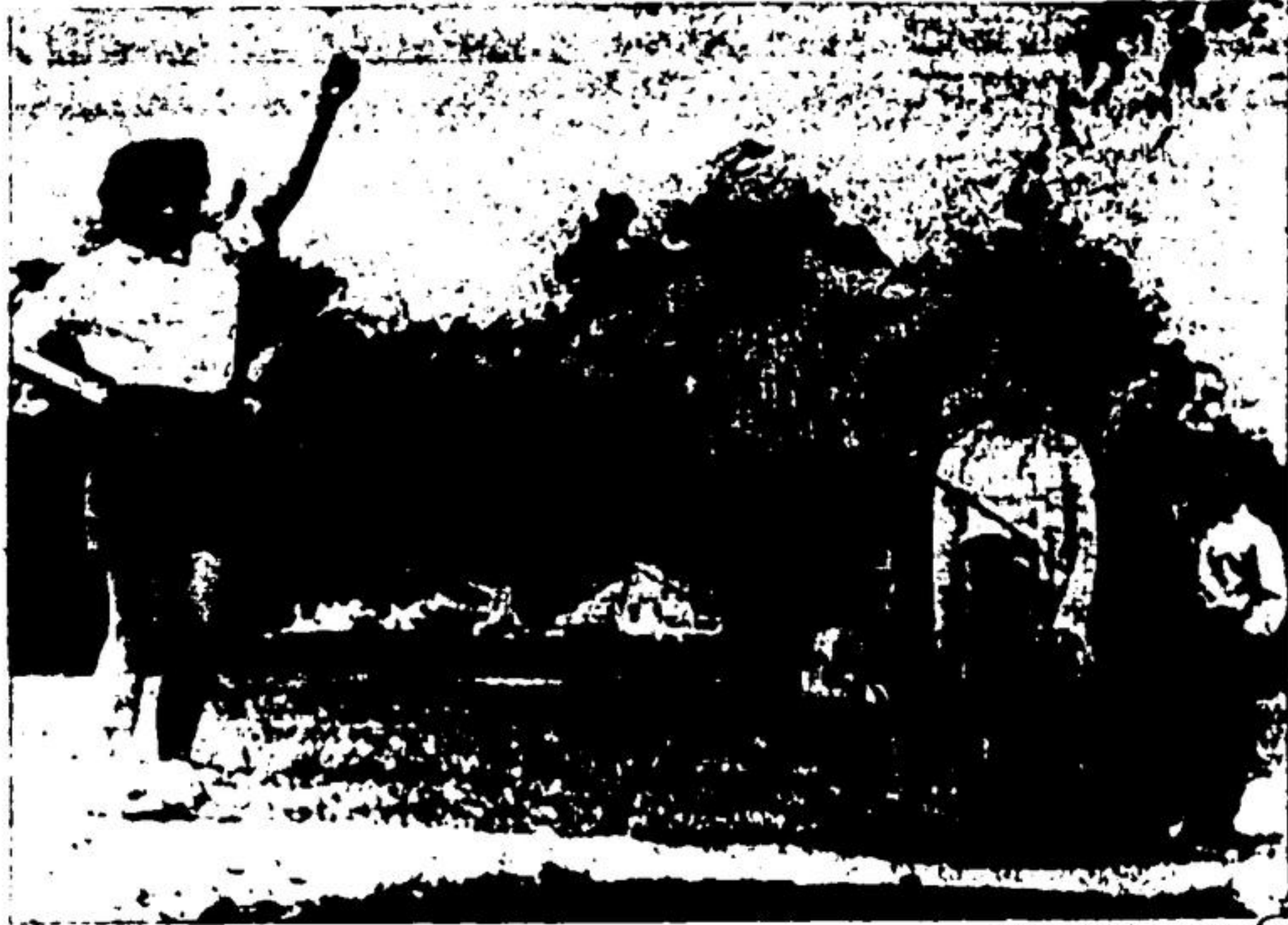
IN THE AIR with a running broad jump is Eddie Gooyers at Rockwood school field day last week. Competition was keen with many contestants vying for championships.