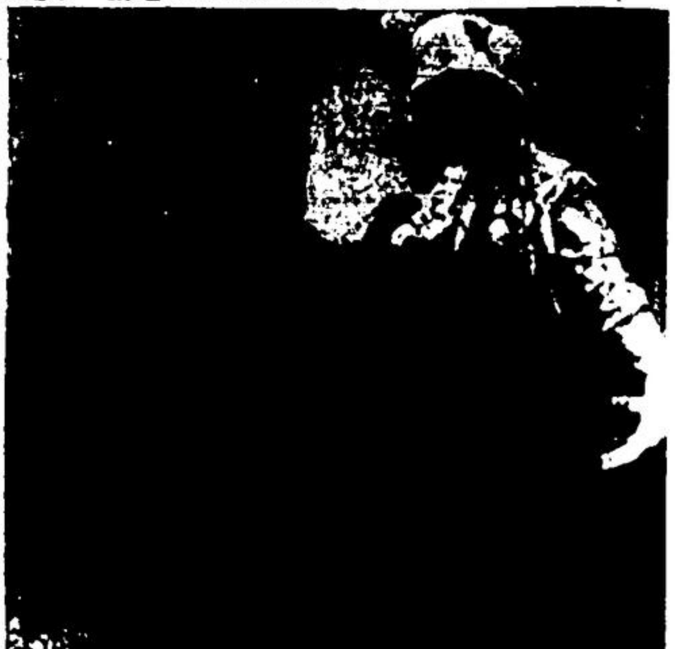
BLUE ARCTIC WILLOWS were planted at Pioneer Cemetery Sunday rather than a wreath at the recent Decoration Day committee members Vic Patrick and Mrs. Alec Orr are shown beside one of the shrubs. Long range plans call for planting a couple of shrubs each year. The plan was laid out by decoration day committee members and Ted Swift of Blue Springs Nursery. Different shrubs will be planted each year.