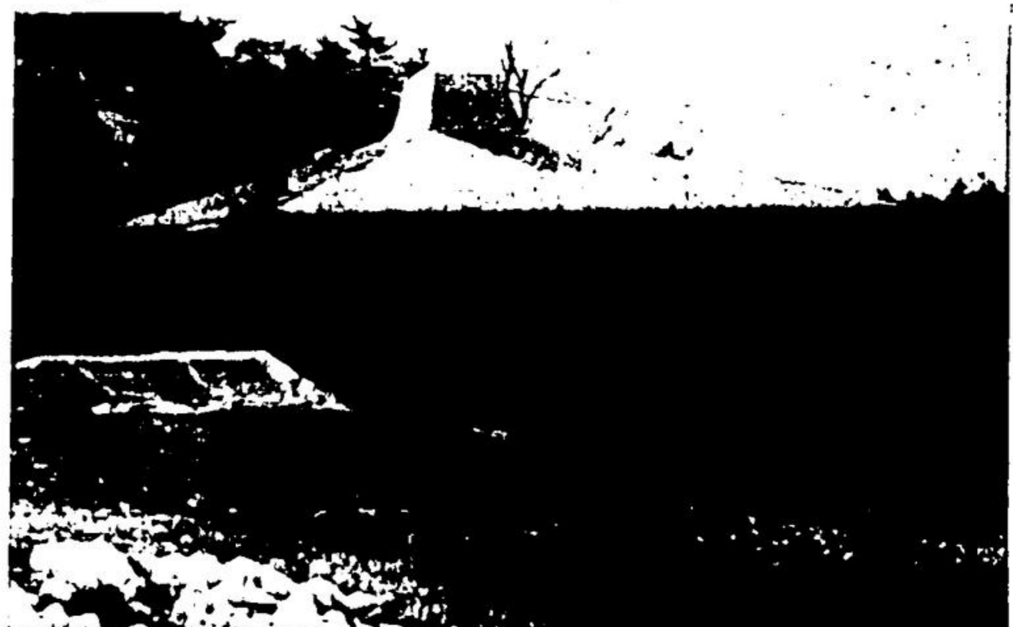
CONSTRUCTION CONTINUES on the new pavilion being erected at Rockwood Conservation park and it is hoped the building will be ready for patrons within a few weeks. Rockwood park provides a fine view over the river and many people visited the park last year for picnics and relaxation.