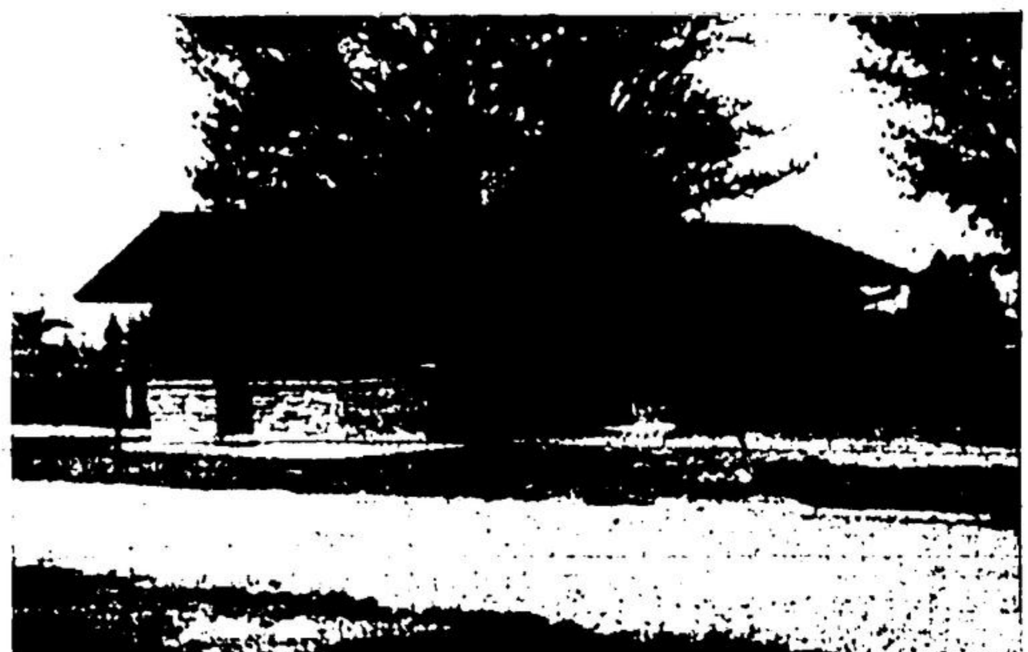
ATTRACTIVE GATEHOUSE at Rockwood Conservation park has been completed and patrons will stop here for information regarding picnic sites. A large crowd enjoyed the warm weather Monday when people enjoyed cookouts at the fast-growing park area. Plenty of picnic tables are being supplied and bathing is one of the main attractions for the youngsters.