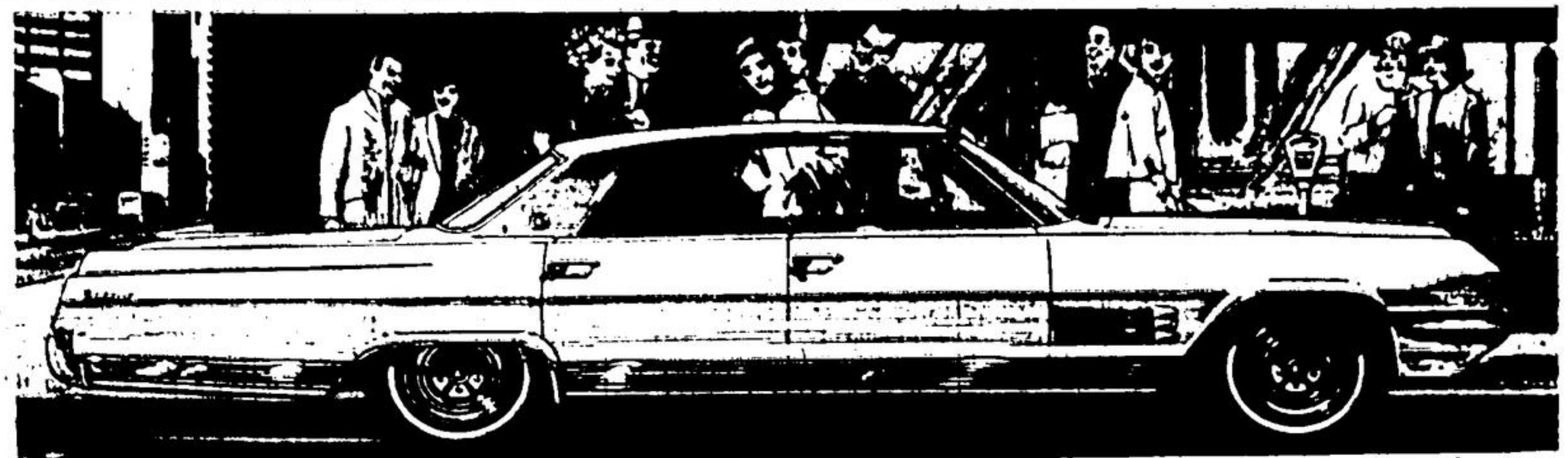
Buick has the kind of beauty that attracts crowds