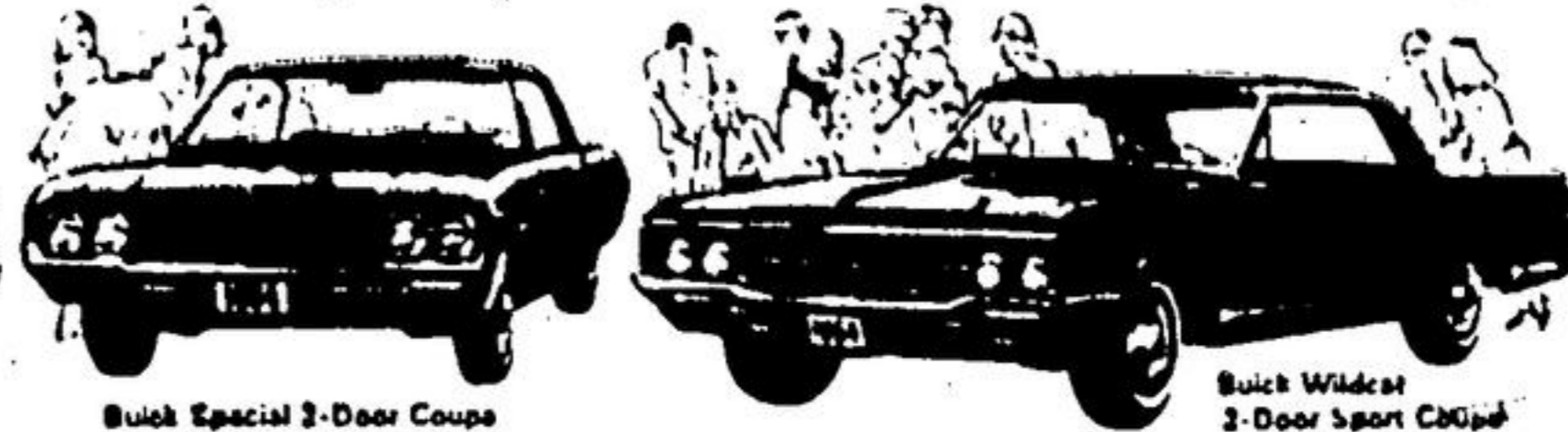
Buick Special 3-Door Coupe