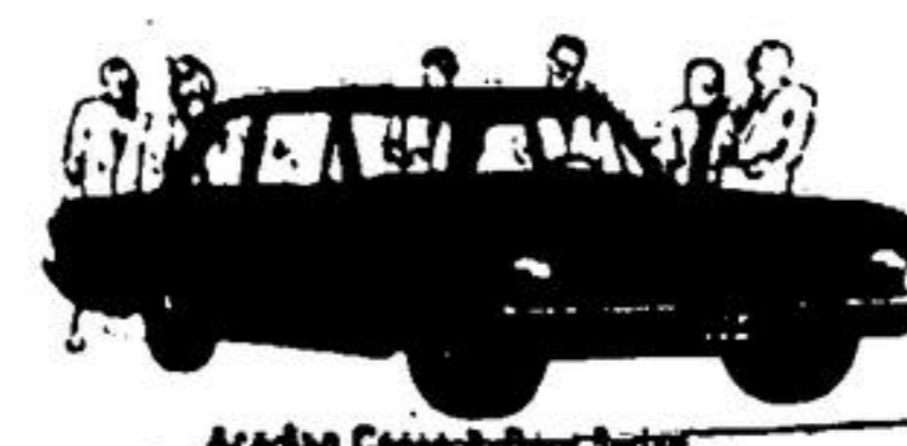
Acadian Coupe 3-Door Sedan