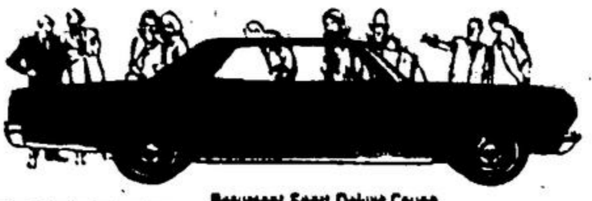
Beaumont Sport Deluxe Coupe