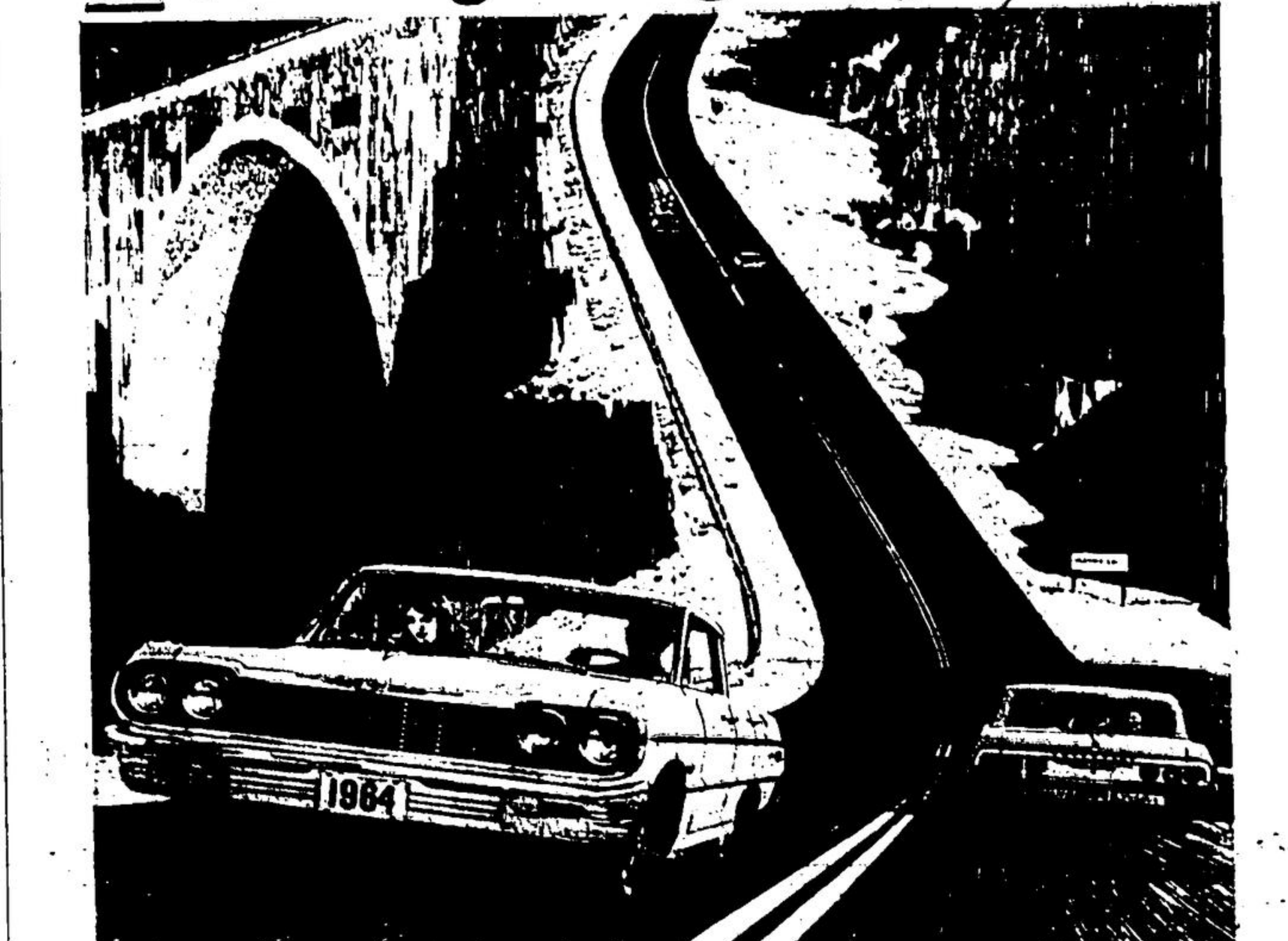
A GENERAL MOTORS VALUE '64 Chevrolet Impala Sport Sedan and (background) Impala Sport Coupe