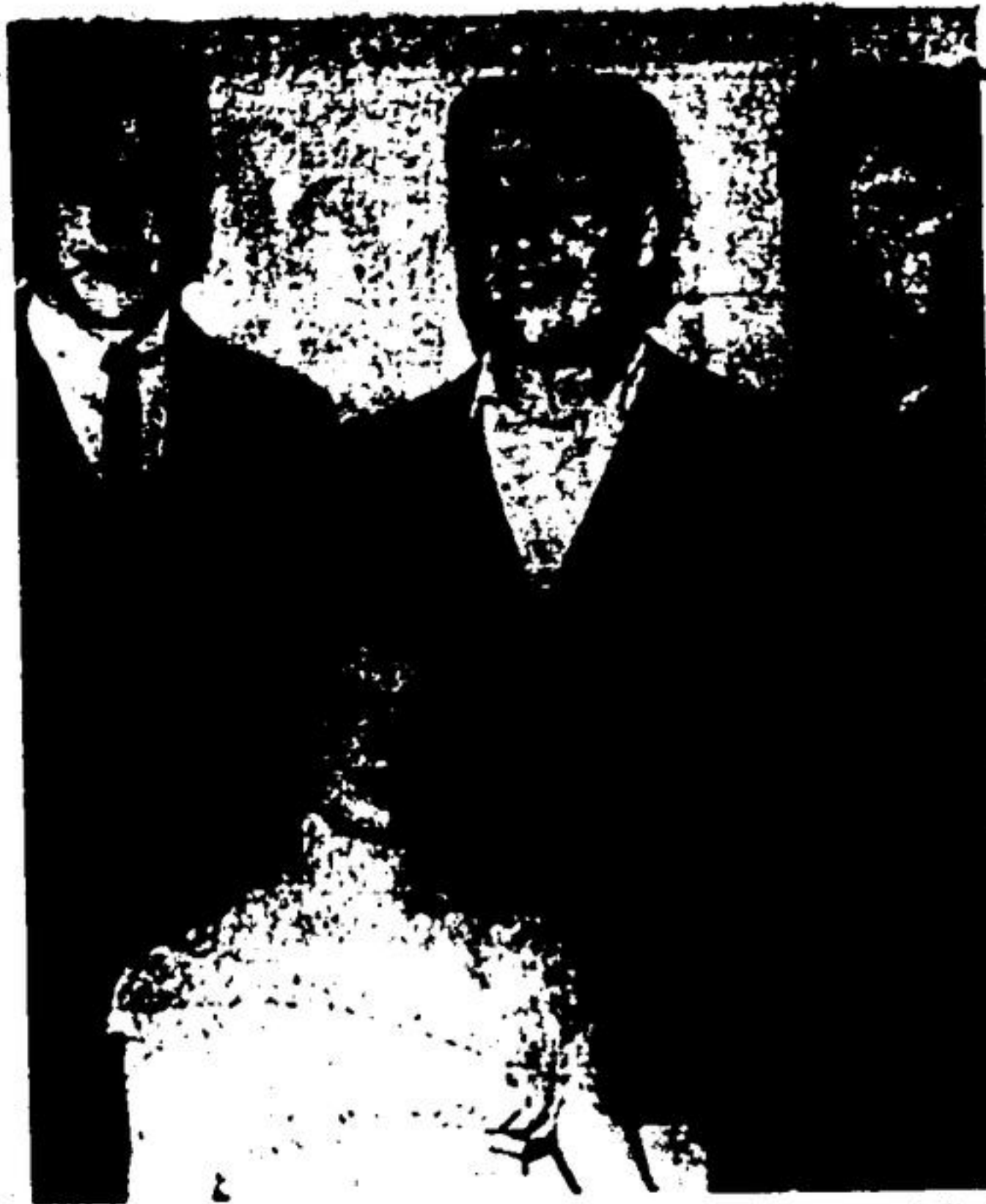
— BLUFF PHOTO

The continuing interest and support by the members of the Board of Health and County Council for the work of the Health Unit is much appreciated. I pressed to our staff members for the many hours of diligent and effective work carried out during 1963.