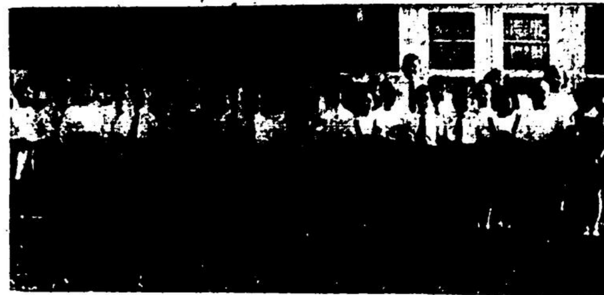
M. Z. BENNETT SCHOOL copped the trophy when they won the competition last week in the primary choir class during the North Halton Music Festival. The happy youngsters are pictured above after they had received the John Milton Chapter I.O.D.E. award.

The Central Ontario Mixed Team Champions, who had local