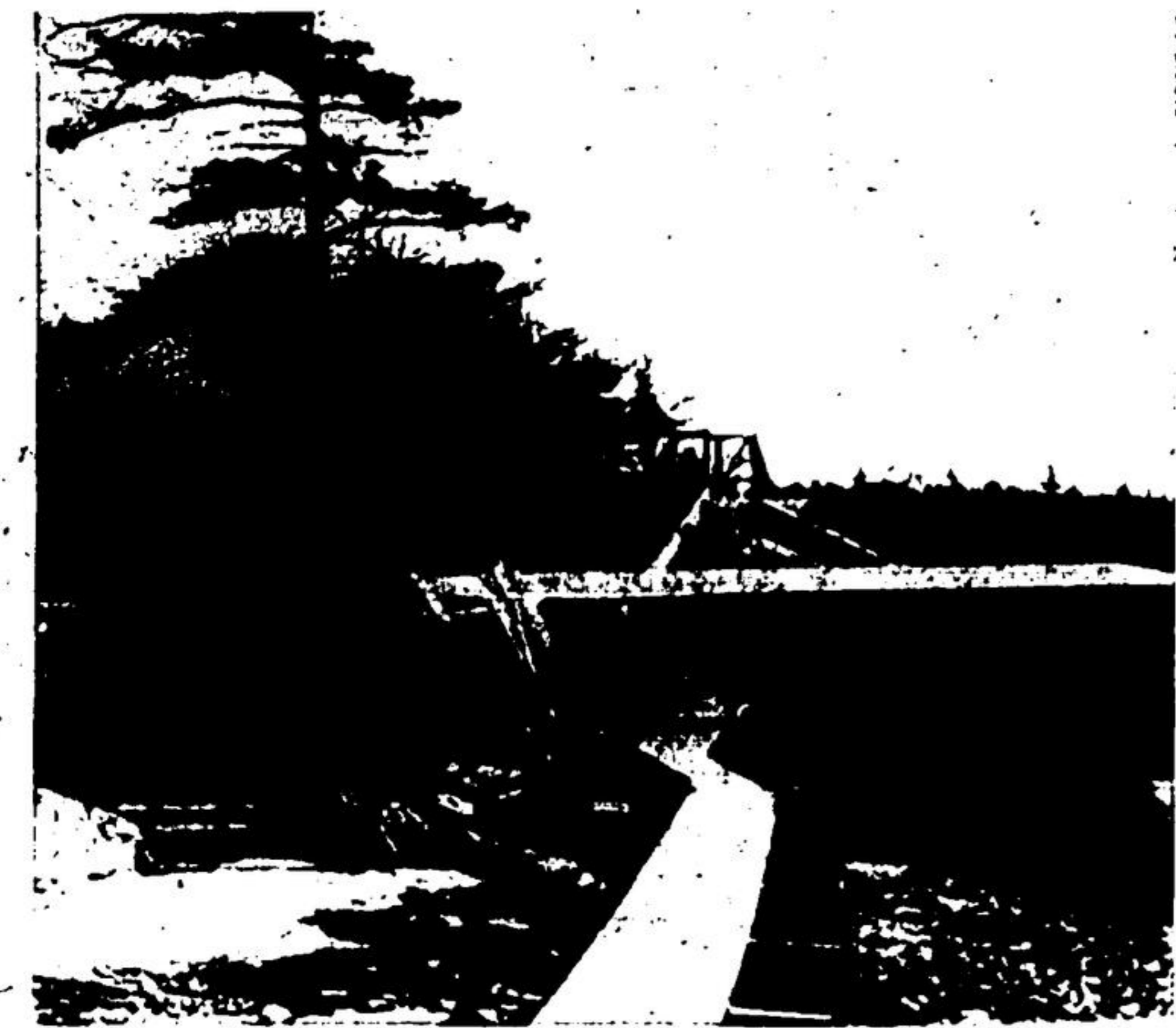
NEW PAVILION at the Conservation Authority Park at Rockwood is under construction. The main timbers have been shipped here from British Columbia. The park is being regularly improved since it has been taken over by the Conservation Authority.

YES. BE SURE TO KEEP THE Acton Free Press WITH COMPLETE ROCKWOOD COVERAGE COMING YOUR WAY WEEKLY SUBSCRIBE NOW ONLY $3 A YEAR Less Than 6c a week WRITE TO ACTON FREE PRESS 59 Willow St., Acton JUST SAY KEEP IT COMING And Enclose Your Cheque or Money Order