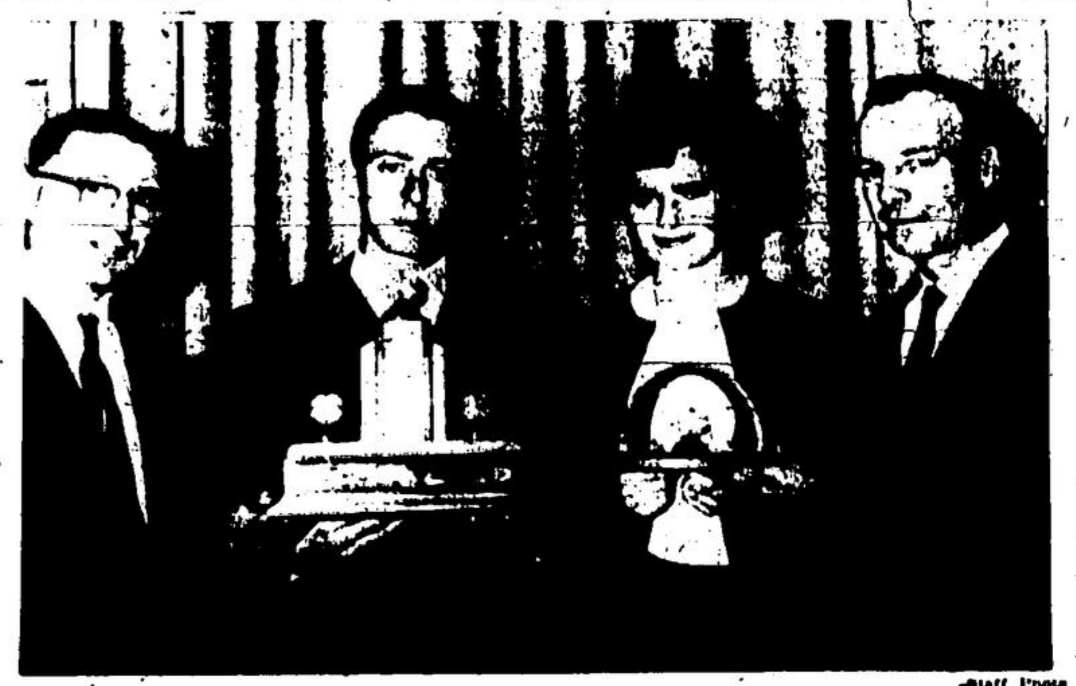
ACTON'S 4-H CALF CLUB was named the Premier 4-H Club in the area on Friday evening at the annual 4-H Awards night in the Williams Avenue High School, Milton.