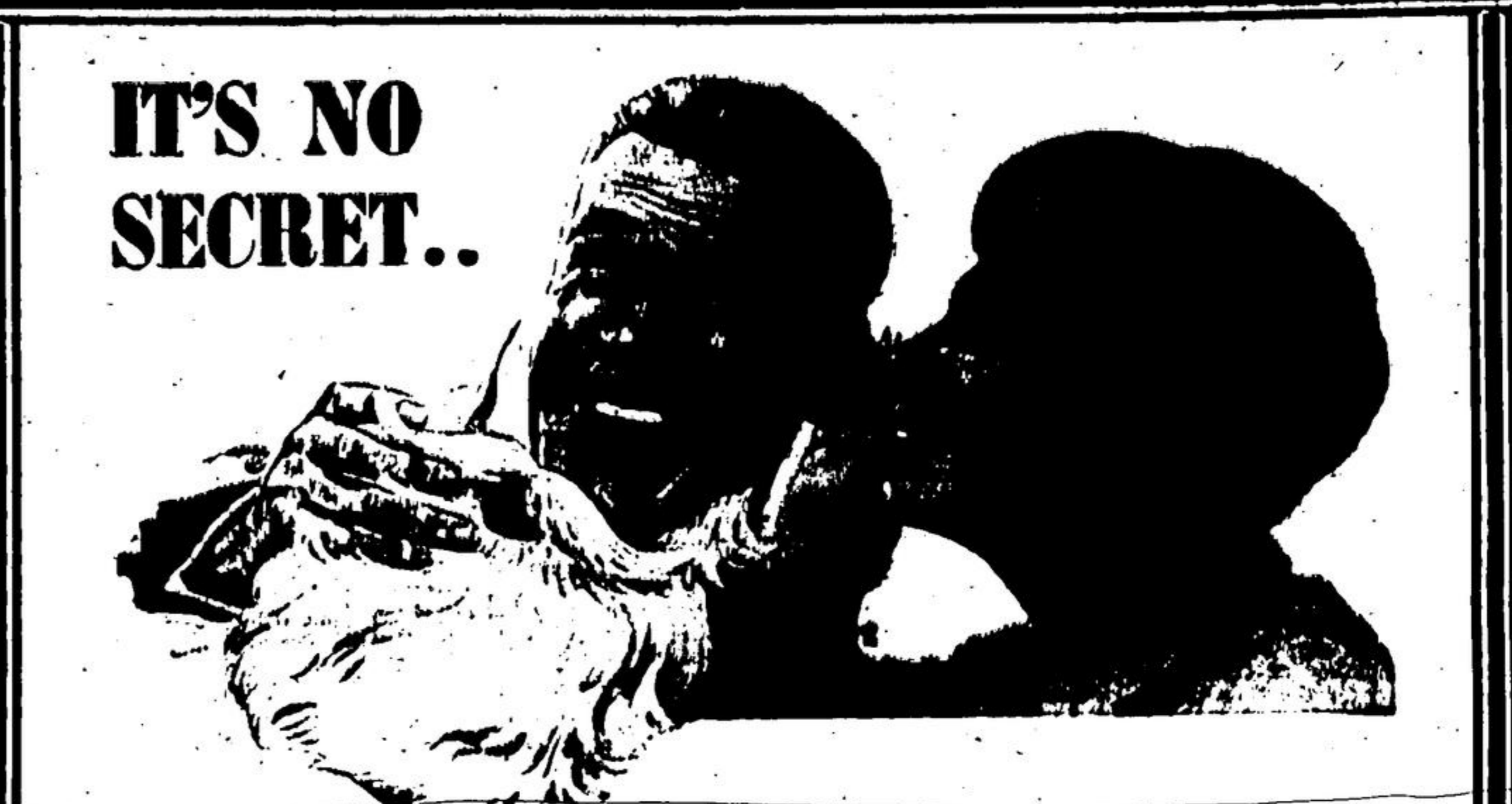
IT'S NO SECRET..

The executive of the Community Club met Monday evening for their monthly meeting. The hall has been rented for a wedding reception on November 30 and to the junior farmers on December 6. Plans for the annual meeting on December 13 were made.