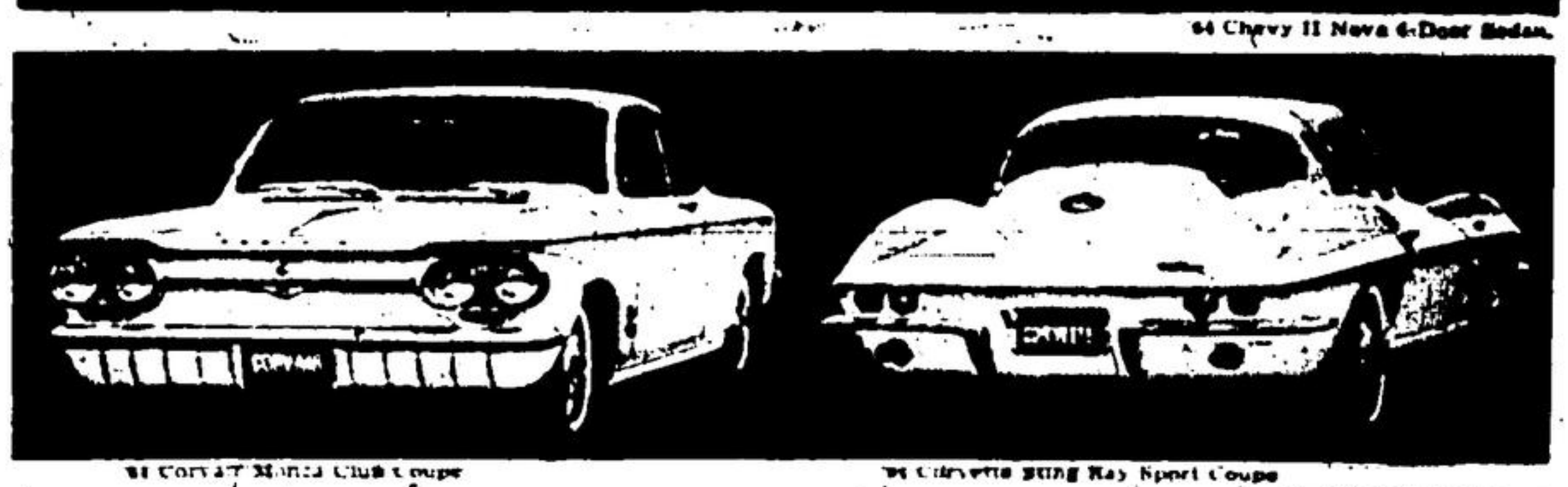
'64 Corvair Monza Club Coupe

New pep and new comfort '64 CORVAIR! Big new air-cooled 6 goes into every '64 Corvair. It's still at the rear, of course, for better traction and easy handling. '64 CORVETTE! Major suspension refinements make Corvette ride more smoothly. New transmissions go with the four big V8s.