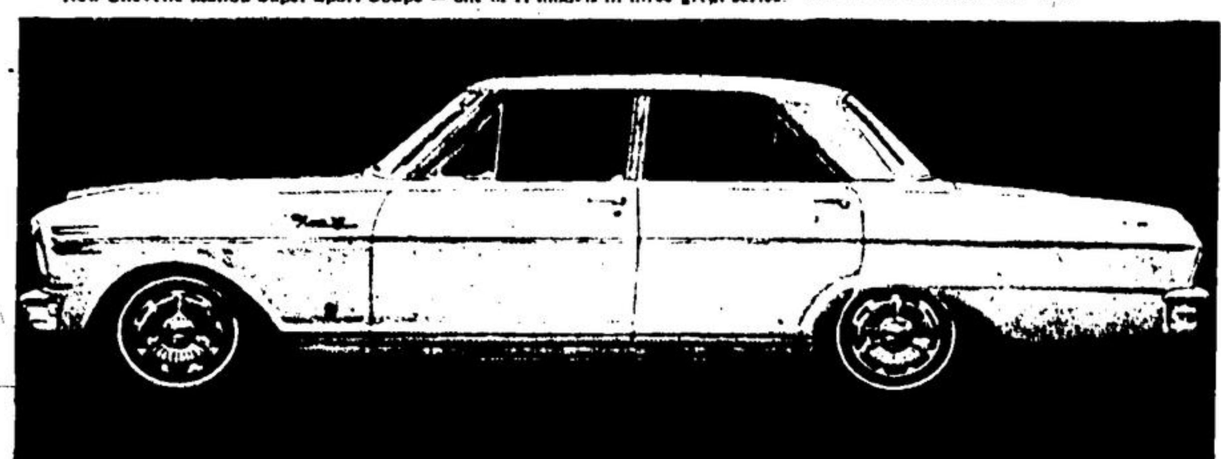
'64 Chevy II Nova 6-Door Sedan.

'64 CHEVY II with a lively new V8! More than ever, this low-cost family car looks and goes as if it were anything else but that. Three lively, economical Chevy II engines: 90-hp Super-Thrift 4; 120-hp Hi-Thrift 6; and a new extra-cost 195-hp Turbo-Fire V8. Lots of things make for lower upkeep — and make Chevy II tops in value.