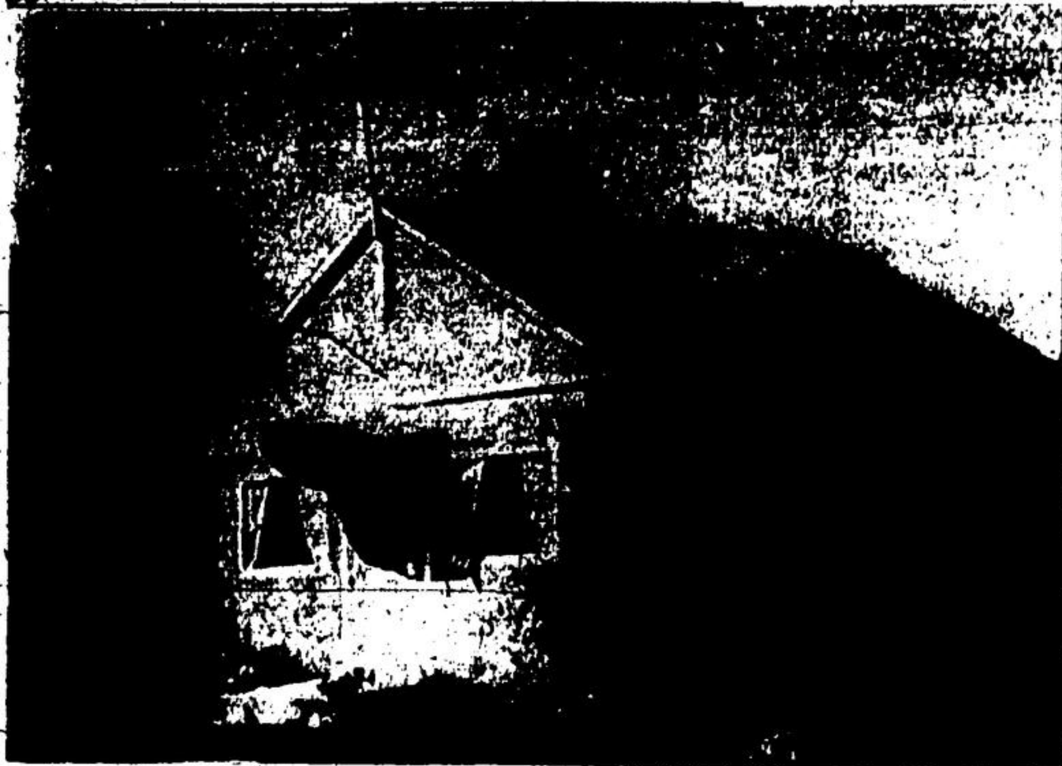
ACTON FIREFIGHTERS won second prize for their fall fair float which dramatically depicted a burning house to stress fire prevention. At times so much smoke was pouring from the roof of the burning house, bystanders had to move hastily from the parade route. A smoke bomb inside the mock building provided the realistic effect.