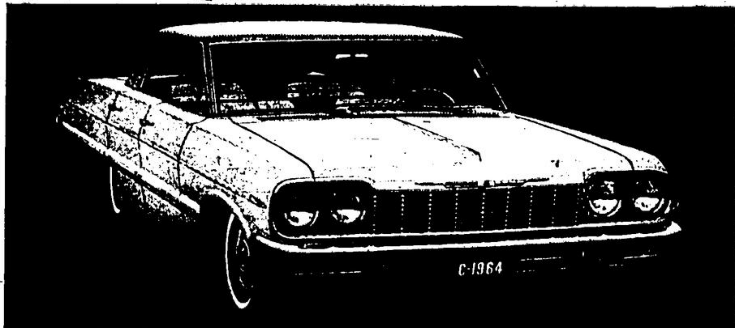
'64 Chevrolet Impala Sport Sedan — one of 15 Jet-smooth luxury Chevrolets.

Big luxury, big style, big room in the most luxurious CHEVROLET ever!