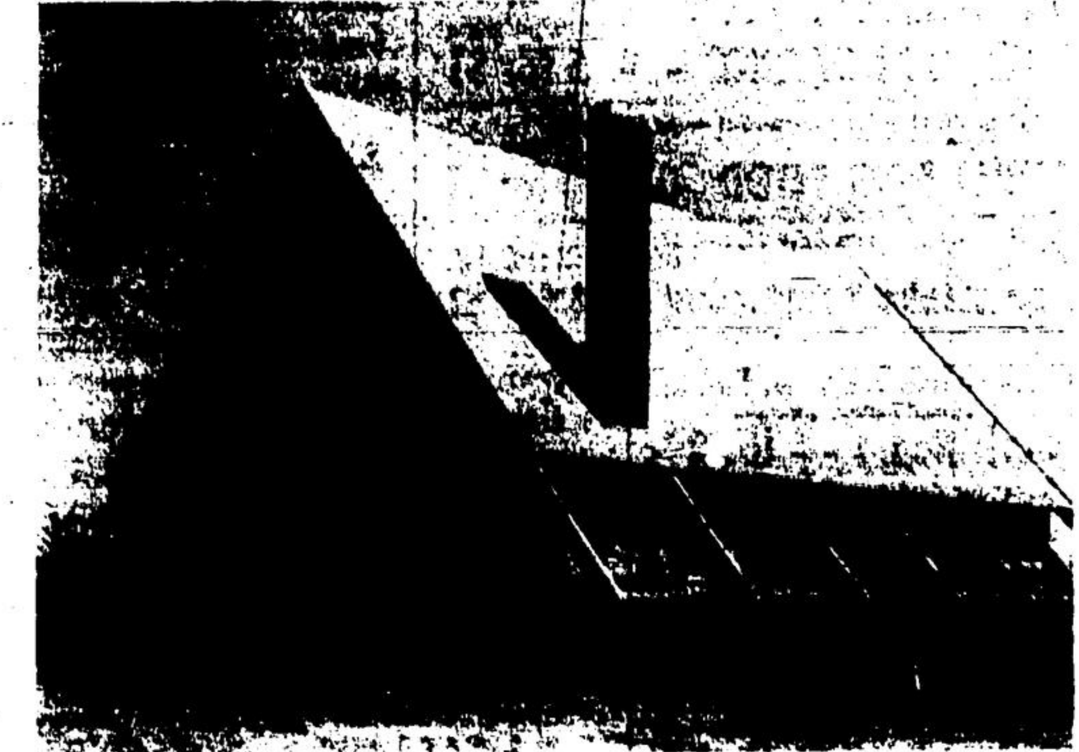
EXTERIOR WORK on the Christian Reformed Church has been completed and workers are finishing the interior. The modern structure was designed by members of the congregation and the front of the building faces the proposed extension of Peel St. Three railings on the cement steps at the entrance are still to be installed. Grading has begun and the ground will be landscaped.