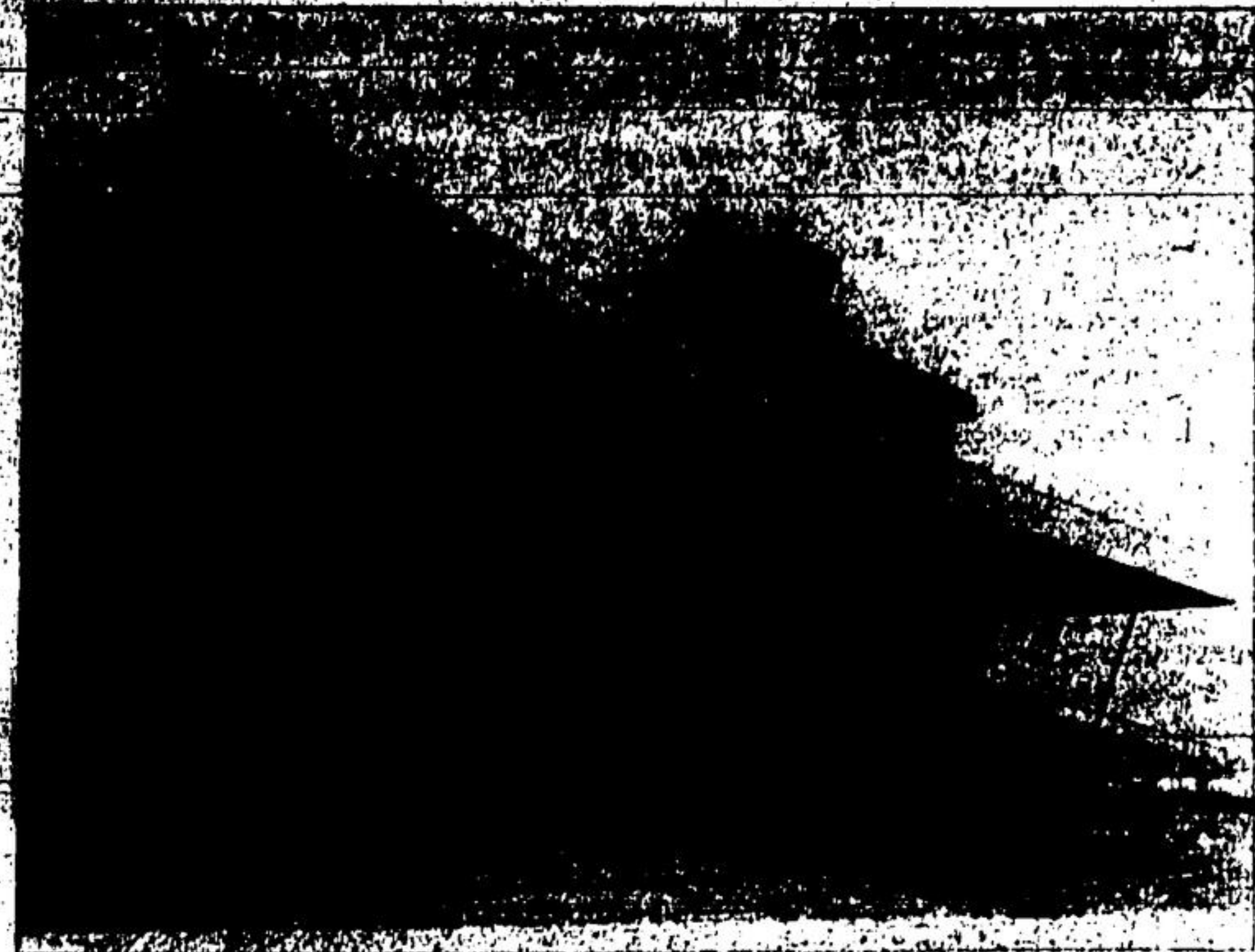
THE GRANDSTAND at Mohawk Raceway near Campbellville nears completion, with the racing season due to start in eight days. Workmen are working rapidly in an effort to put all in readiness, with only interior work beneath the grandstand, lagging behind. Part of the grandstand is glass-enclosed, above.