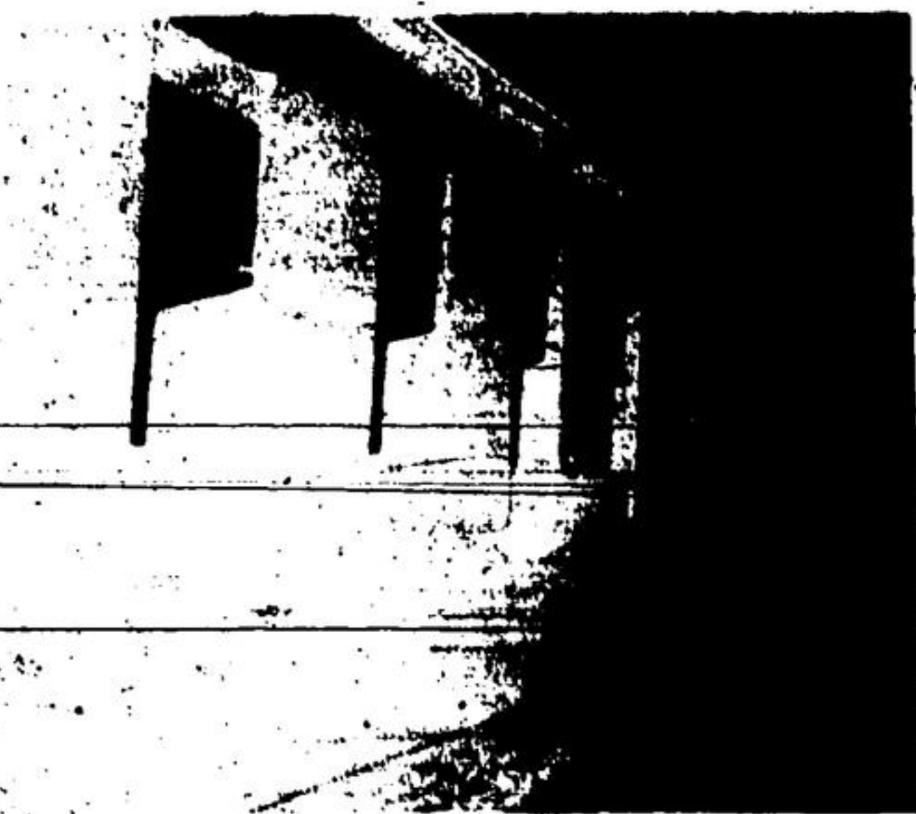
ROWS OF TICKET BOOTHS are waiting for the patrons, at the new Mohawk Raceway near Campbellville. Within the next month, patrons from all over Ontario will be swarming to the track to follow the trotting circuit.