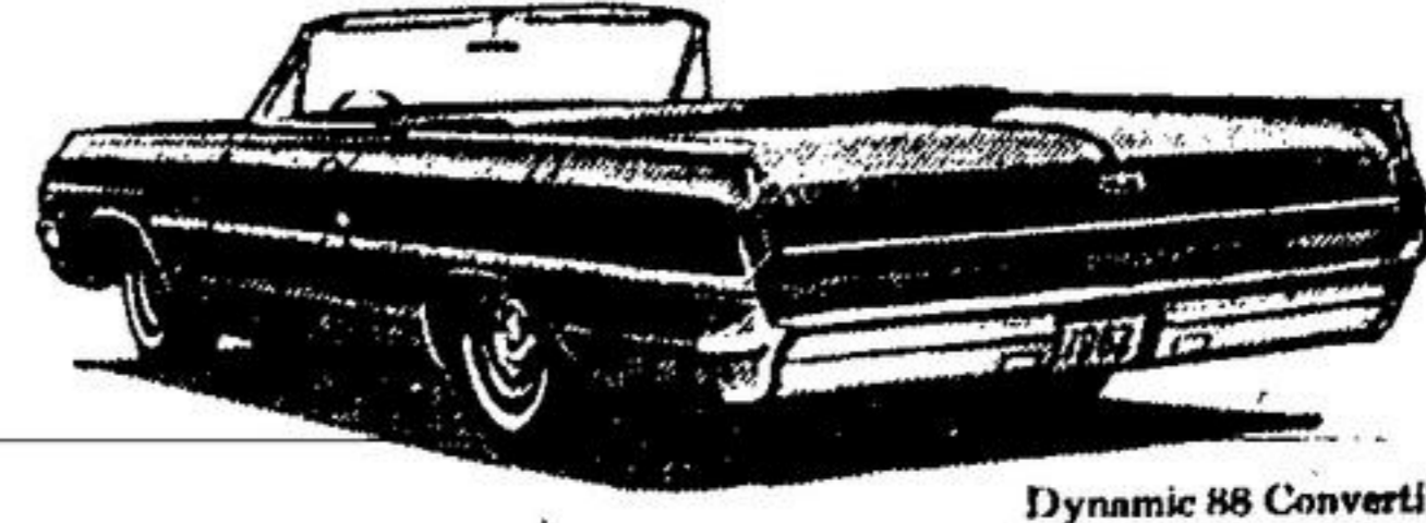
Dynamic 88 Convertible