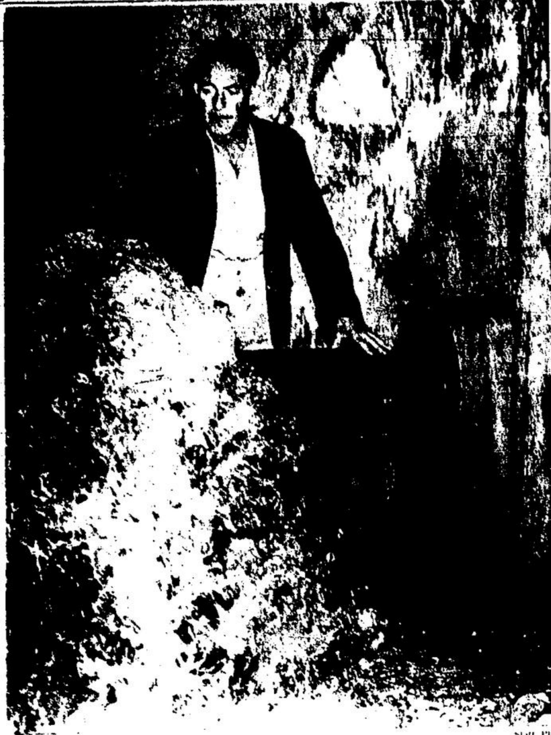
460 GALLONS of water per minute gushed from this pipe at the bottom of one of the two new horizontal gas-reserve tanks on Church Road North Tuesday when the tank was filled for testing. Shown at the pipe is town worksman Sam Tennant. Water level in the reservoir is controlled by a pressure system which turns the demand pumps on automatically. Work on the excavation for the reservoir system began May 6.