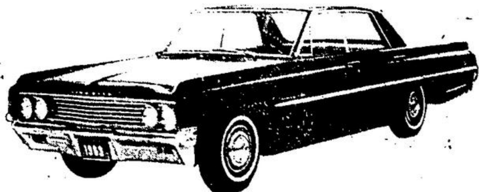
1963 OLDSMOBILE. An entirely new roof line is the chief characteristic of the 1963 Oldsmobile Dynamic 88 Holiday Sedan shown here. It is one of six Dynamic 88 models, which include two sedans, a coupe, two station wagons and a convertible.