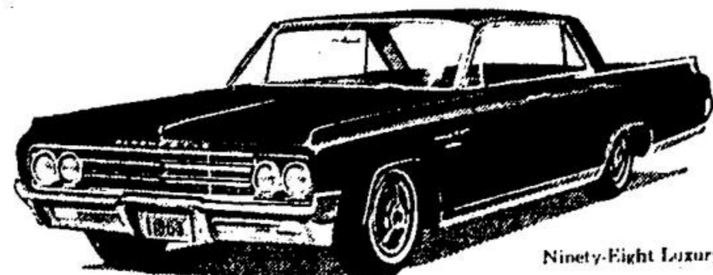
Ninety-Eight Luxury Sedan