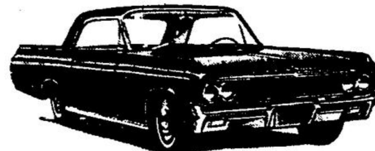
Super 88 Holiday Coupe