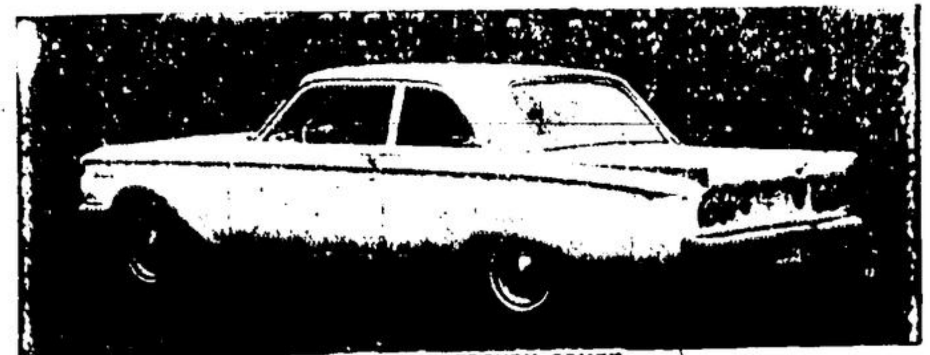
THE 1962 MERCURY COMET