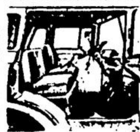
*Bumper-to-Back of Cab

The rugged GMC steel tilt cab L7000 Model illustrated is rated up to 76,800 lbs. GCW. A torsion bar mechanism allows safe, easy cab-lifting, retaining entire engine and stationary control island for fast, easy service. Short 72" BBC* permits longer loads. What's more, GMC's balanced truck design for '62 ensures long-life, safety and rugged load hauling ability. Get the full bonus facts on how this means money and economy to you. See your GMC dealer, soon!