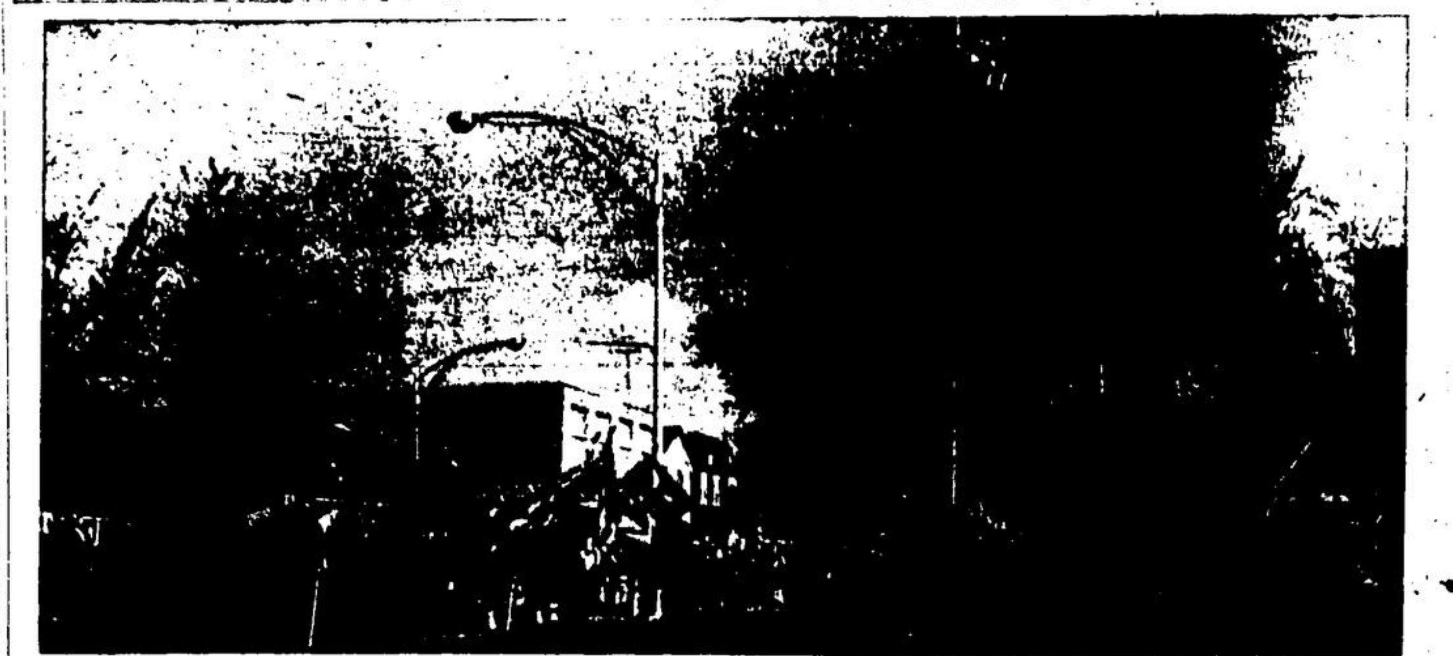
REMEMBRANCE SERVICE in Acton was well attended Saturday morning. The color party is pictured above in front of the cenotaph with flags raised as members of the Lorne Scots form a guard of honor. Following the brief service at the cenotaph when wreaths were placed by various organizations, the parade filed into the United church for a Remembrance Day service there.

Sunday morning another group of Legionnaires from Acton Branch 197, went to Rockwood where they participated in Remembrance Day services there.