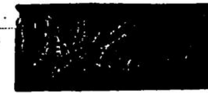
—Quite a number of citizens are suffering from the flu.

—Hydro workers are completing the wiring at the arena this week.