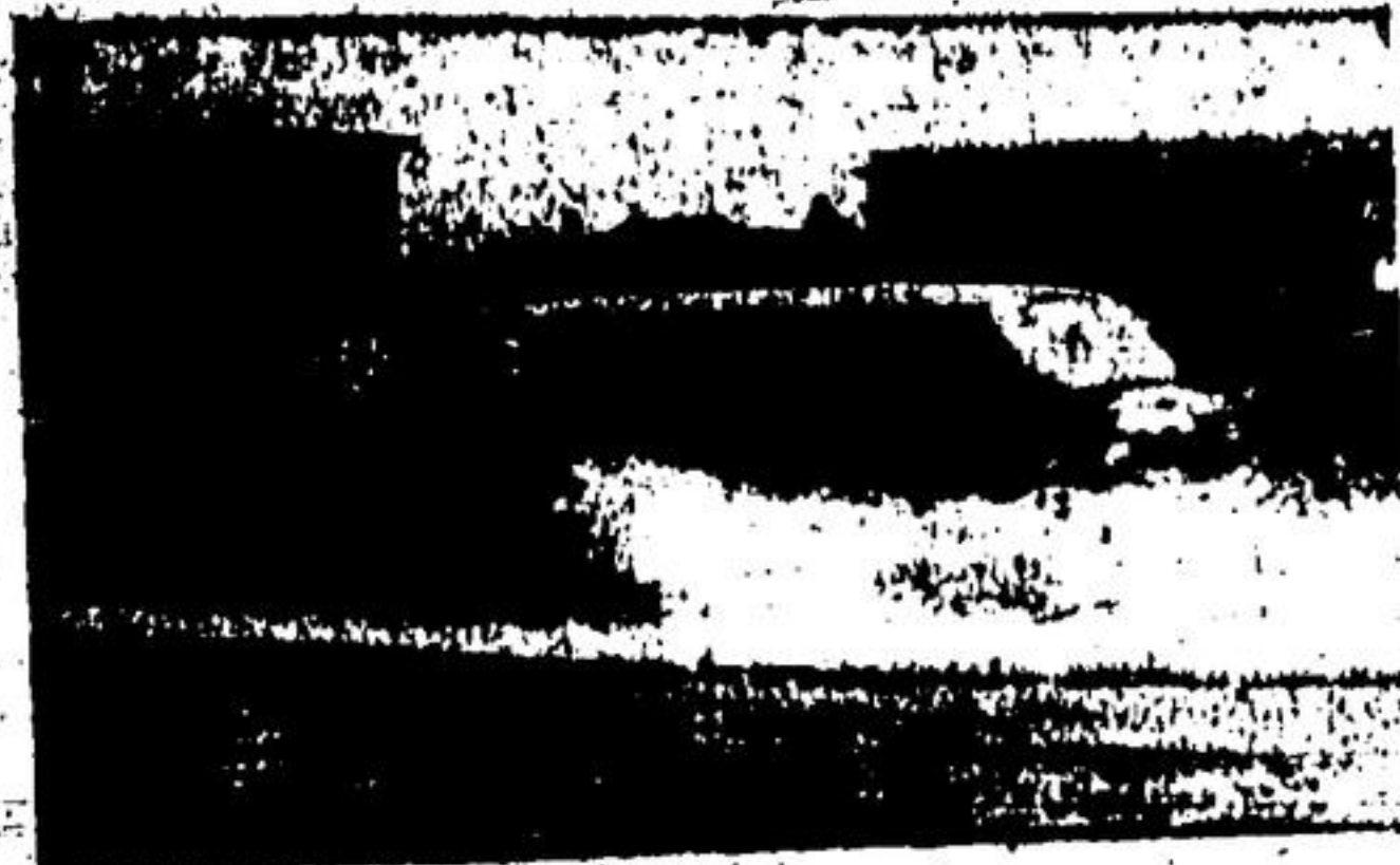
FRIDAY'S DOWNPOUR may have brought enjoyment to some youngsters who went paddling in the small streams but motorists and town workmen found some difficulty. In the top photo a car is shown driving through the foot and a half of water which gathered in a short time opposite Jack McCallum's service station. Second photo shows an Acton taxi rushing to a call as a spray of water flaps and lower photo shows two town workmen trying to unplug the drain at the school creek on Main St.