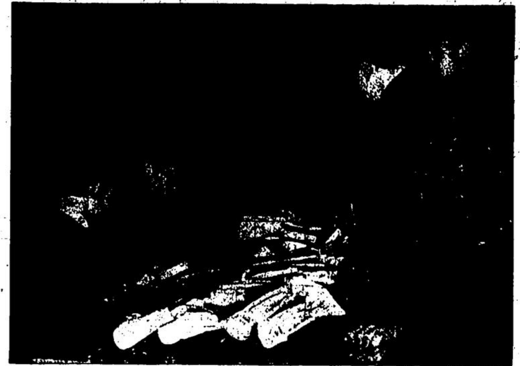
KNICK-KNACKS were picked up by children at the white elephant sale booth Friday afternoon during the school Fun Fair. Net proceeds amounting to over $111 will be used to boost the pupil's $200 Community Centre pledge. Some of the smaller kiddies had a difficult time choosing their surprises.

A committee set up with a representative from each grade is determined to meet their quota and next plan a variety talent show, the final day of school. They are looking toward a packed auditorium. Pupils with a little or a lot of talent will participate in the show and once again proceeds will be used to reach the $200 goal.