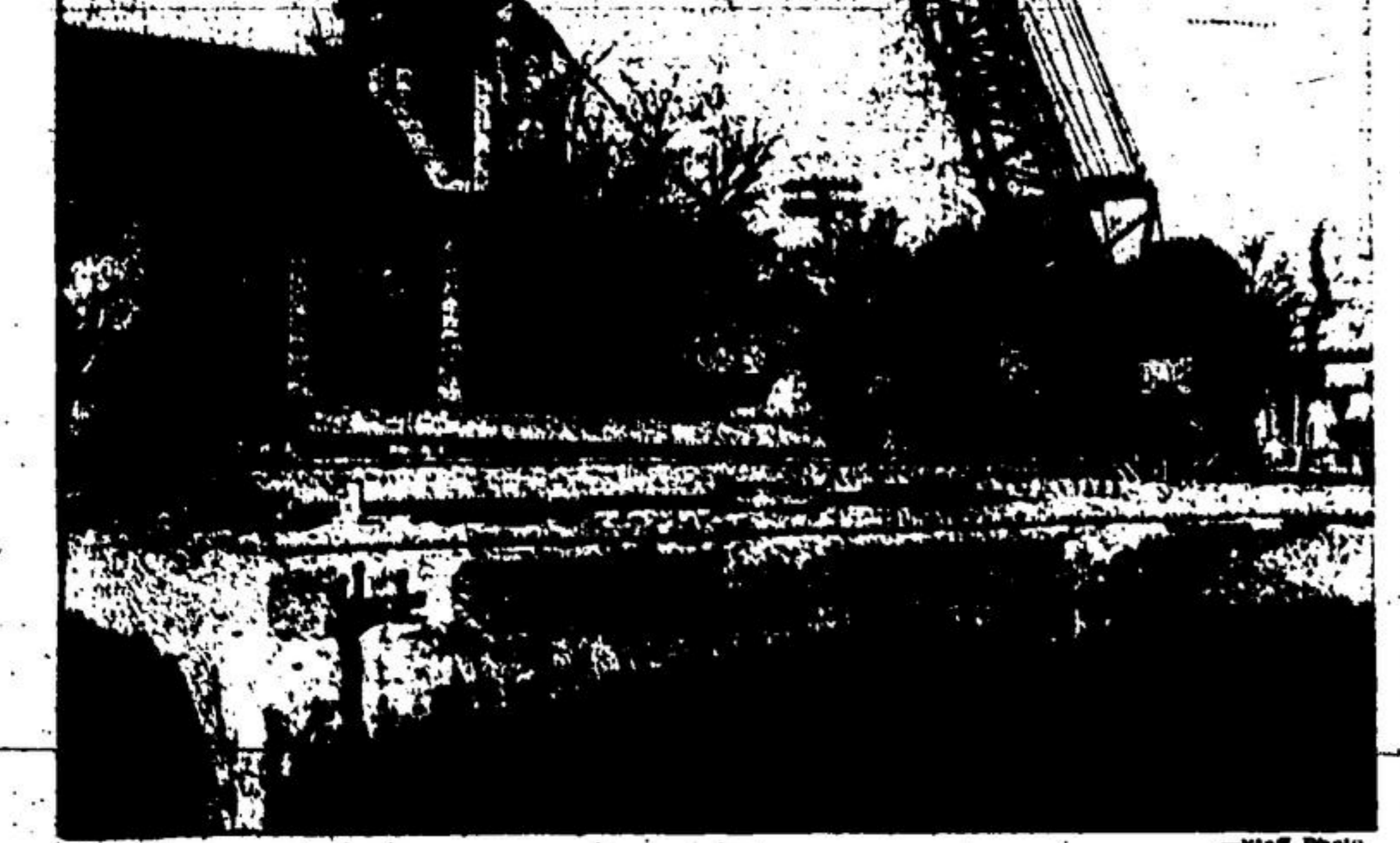
PRECAST CONCRETE FORMS were placed at the new Bell Telephone dial exchange building on Church street Monday and before evening the entire floor had been laid and pre-cast concrete uprights for the walls installed. A huge crane lifted the heavy forms from trucks and placed each one in the right spot. Work is progressing favorably, according to construction officials.